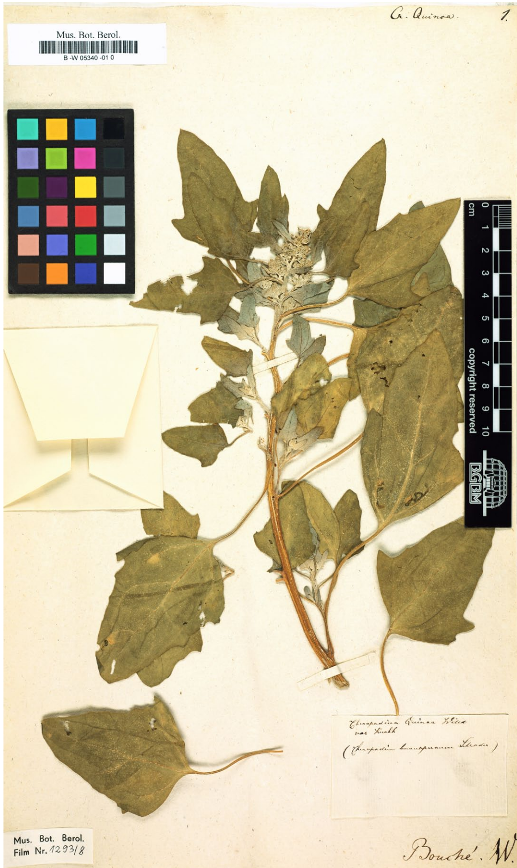
Fig. 2. Lectotype of Chenopodium quinoa – Berlin, Botanischer Garten und Botanisches Museum Berlin-Dahlem, Herbar Willdenow (B-W 05340-01 0 [= B-Willd. 5340/1] http://data.bgbm.org/herbarium/BW05340010 ).