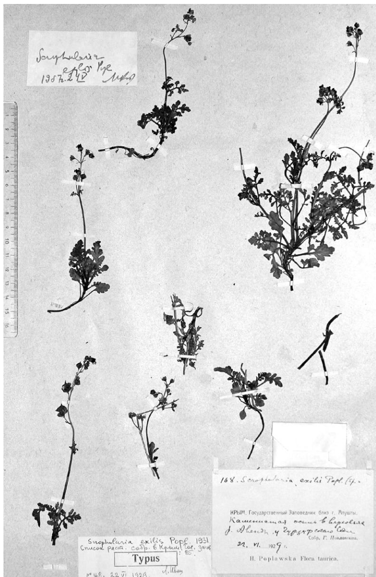
Fig. 2. Holotype of Scrophularia exilis at LE.

on the slope of Mt Shagan-Kaya in the Crimean Nature Reserve, 44°34'44"N, 34°13'36"E, 1345 m, 11 Jun 2012. Both localities were on east-facing rocky scree slopes (Fig. 1A) formed of fragments of Jurassic limestone and divided into relatively stable parts and mobile parts (Fig. 1B). The plants of S. exilis grew only on the mobile parts in three areas (c. 200, 800 and 850 m 2 ) on Mt Djunyn-Kosh and one area (about 2400 m 2 ) on Mt Shagan-Kaya. There were more than 400 individuals on Mt Djunyn-Kosh and more than 700 individuals on Mt Shagan-Kaya.