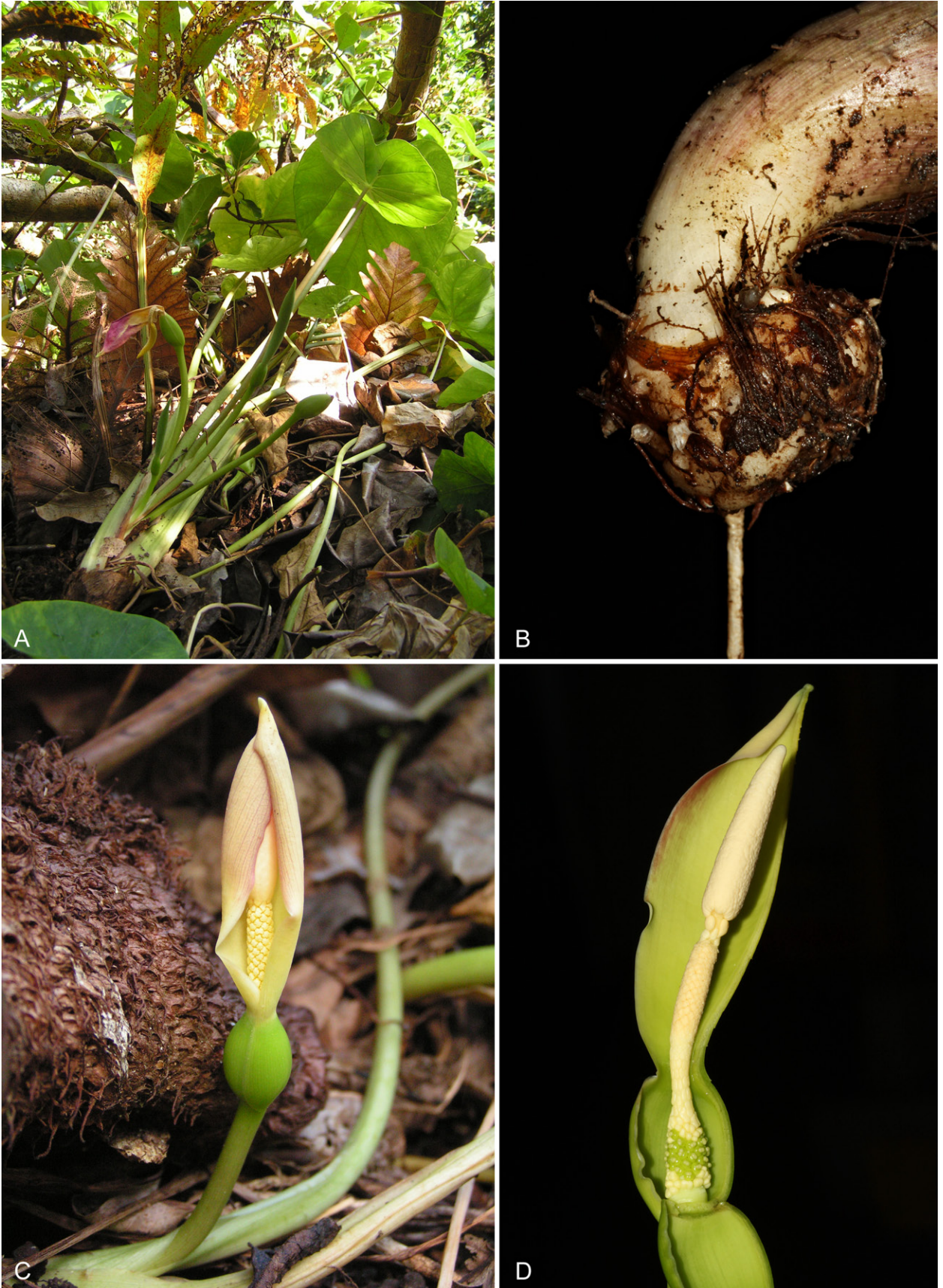
Fig. 2. Alocasia evrardii – A: plant in habitat; B: tuberous stem; C: inflorescence at anthesis; D: young inflorescence with spathe tube opened to show spadix. – Photographs: Vietnam, Binh Thuan province: Takou Nature Reserve area, 2 Oct 2009, H. T. Luu.