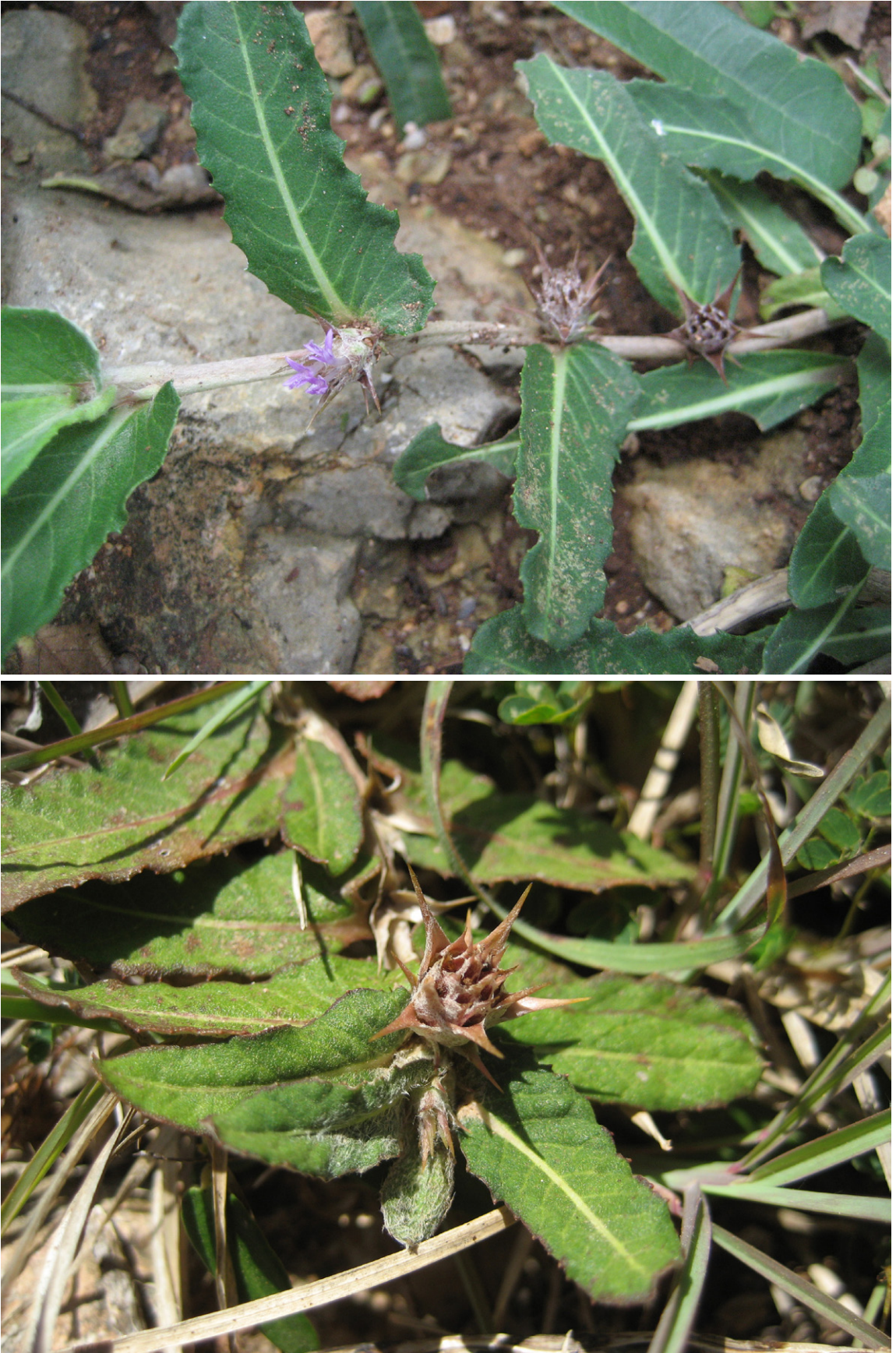
Fig. 1. Acanthodesmos gibarensis at the type locality – A: flowering shoot, November 2011; B: shoot with with mature capitulum, April 2013. – Photographs by Pedro Alejandro González Gutiérrez.