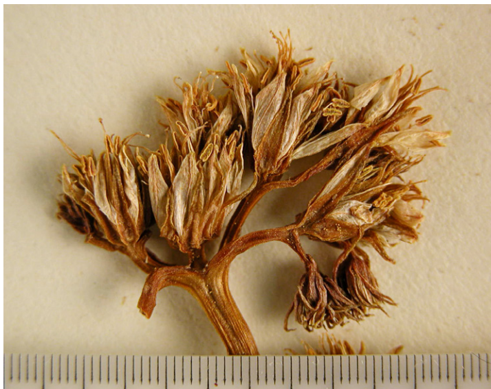
Fig. 2. Close-up of an inflorescence on the holotype of Sedum ochroleucum subsp. mediterraneum . – Scale: lines are 1 mm apart.

Remarks — There is some degree of morphological variability in the S Italian populations of Sedum ochroleucum subsp. mediterraneum , especially regarding sepal length and the filaments sometimes being papillose at the base. This last character, unknown in subsp. ochroleucum , was observed in Campania (M. Alburni, Cilento), Basilicata (between Grassano and Tricarico and between Pignola and Abriola), Apulia (Gargano) and Calabria (Pollino Massif).