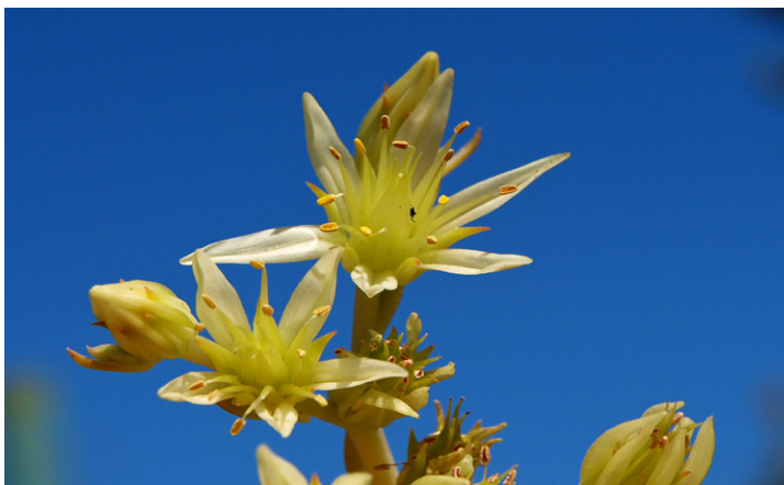
Fig. 3. Close-up of an inflorescence of Sedum ochroleucum subsp. mediterraneum showing petals semi-erect or spreading at anthesis.