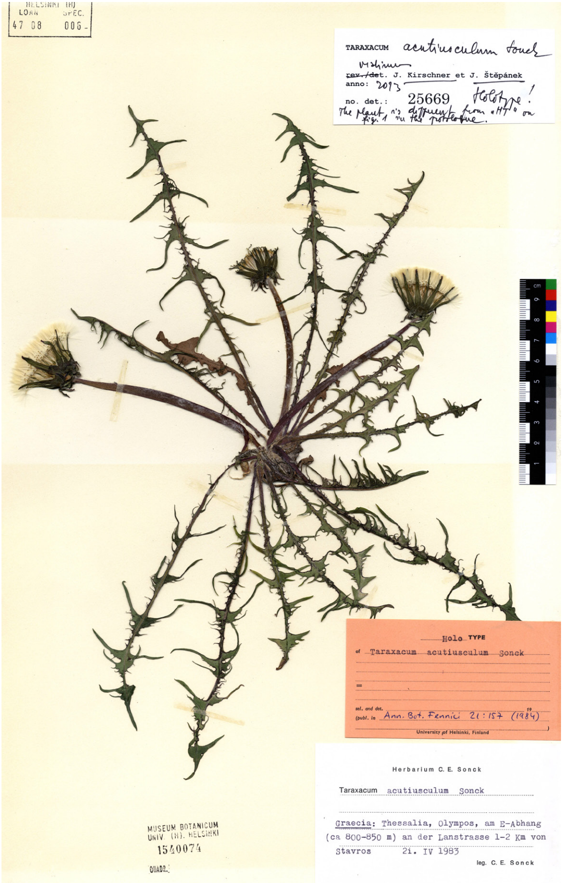
Fig. 1. Taraxacum acutiusculum Sonck. – Holotype (C. E. Sonck s.n., H 1540074 – no. det. 25669).