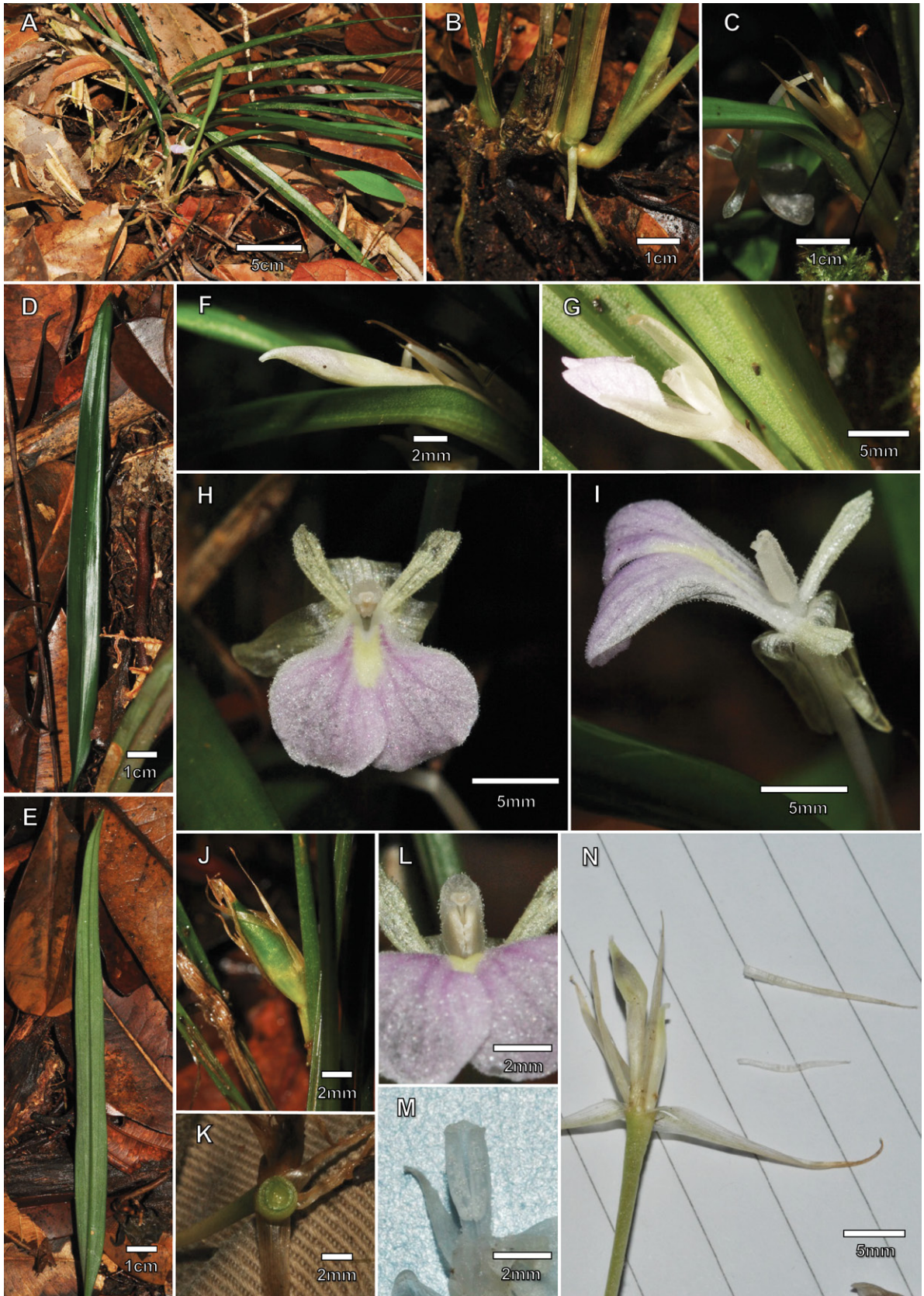
Fig. 2. Scaphochlamys stenophylla – A: whole plant; B: pulvinate petiole base; C: inflorescence with bud and wilted flower; D: lamina adaxial surface; E: lamina abaxial surface; F: bud with visible violet veins; G: corolla lobes opening, labellum uncoiling; H: flower at anthesis, labellum violet with light yellow band along median line until distal cleft; I: corolla lobes reflexed; J: semi-erect fruit; K: immature fruit cross-section; L: stigma and crest; M: spurless anther (specimen in alcohol); N: bracts and bracteoles artificially opened. – A, C, F, G, I & J from OIH74 (type); B, D, E, H, K, L & M from OIH171; N from OIH91