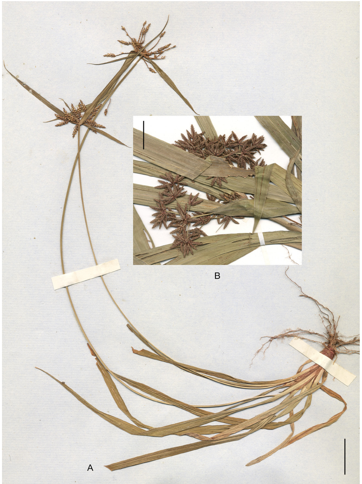
Fig. 2. Cyperus lacustris – A: representative specimen, R. Spruce s.n. (E 153064) from Pará, Brazil. – Cyperus miliifolius – B (inset): detail of representative specimen showing leaves, bracts and inflorescence, L. Holm-Nielsen & al. 19880 (EIU) from Ecuador. – Scale bars: A & B = 2 cm.