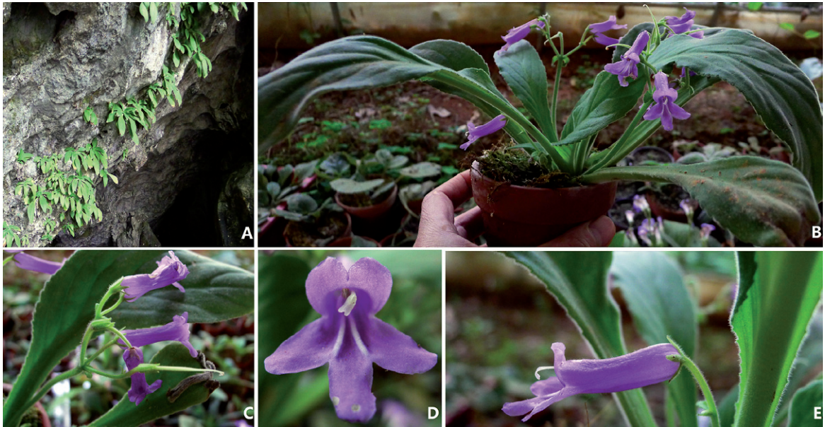
Fig. 5. Primulina orthandra – A: habitat; B: habit; C: cyme; D: frontal view of flower; E: lateral view of flower. – Photographs by Fang Wen; A: type locality of both P. orthandra and P. argentea , 19 Sep 2012; B–E: nursery of Gesneriad Conservation Center of China, Guilin, 7 Apr 2013.

Tong, 570–580 m; Fig. 4A). These two species together with P. orthandra , which is sympatric with P. argentea , can easily be distinguished by the characteristics compared in Table 1 and Fig. 3–5.