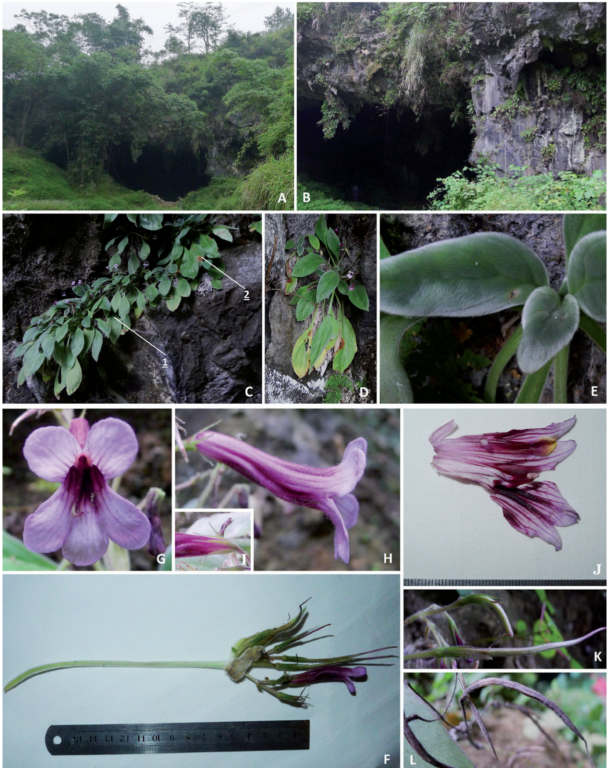
Fig. 3. Primulina argentea – A & B: habitat at type locality; C: plants of P. argentea (1) and P. orthandra (2) growing side by side; D: habit; E: leaves, showing dense, appressed, sericeous-villous indumentum; F: cyme; G: frontal view of flower; H: lateral view of flower; I: calyx lobes; J: opened corolla; K: young capsule; L: mature capsule. – Photographs by Fang Wen, type locality of P. argentea , 19 Sep 2012.

Ecology — Locally abundant in rock crevices on moist shady cliffs at the entrance of a limestone cave at an altitude of 200 m. The annual average temperature of Liannan is 19.5 °C; the average annual precipitation is 1570 mm.