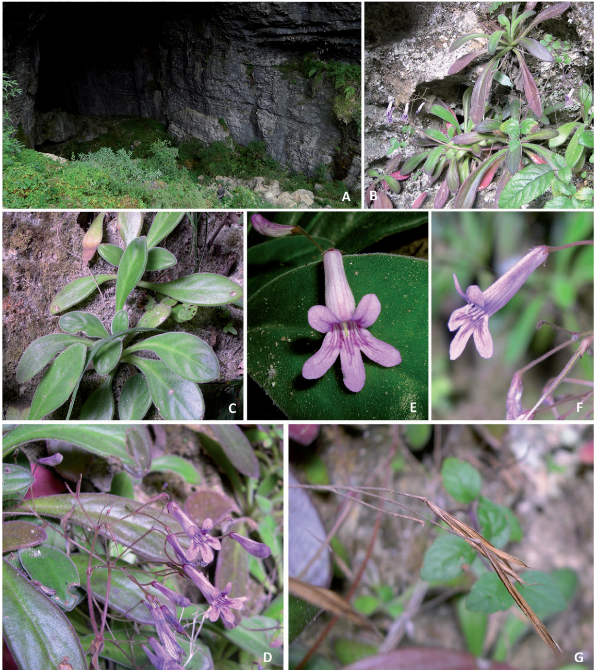
Fig. 4. Primulina fengshanensis – A: habitat; B: habit; C: leaves; D: cyme; E: frontal view of flower; F: lateral view of flower; G: dehiscent capsules. – Photographs by Fang Wen, type locality of P. fengshanensis (see Remarks), 1 Oct 2010.

habitat to survive. If the cave is disturbed or destroyed, the population of this new species might rapidly decline or even disappear. Therefore, we propose that Primulina argentea should be considered Critically Endangered: CR B1ab(iii)+2ab(iii) according to the IUCN Red List categories and criteria (IUCN 2012).