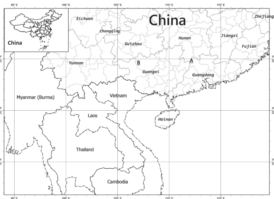
Fig. 1. Known distributions of Primulina argentea (A) and P. fengshanensis (B).

Description — Herbs perennial. Rhizome subterete, 6–9 cm long, 1–1.3 cm in diam.; internodes inconspicuous. Leaves 6–10(–21), opposite, clustered at apex of rhizome; petiole 3–6(–13) × 2–3 cm, densely pilosulous; leaf blade elliptic to obovate-lanceolate, 8–14(–19) × 2–6 cm, thick, chartaceous, both surfaces densely appressed sericeous-villous, hairs on both surfaces and on other parts of plant simple, multicellular, base cuneate-attenuate, margin entire, apex attenuate or with a curved beak; lateral veins 3–5 on each side, abaxially slightly prominent, adaxially unapparent. Inflorescence cymose, each plant bearing 7–10 flowers borne in 3–8 cymes; peduncle 10–14 cm long, c. 0.3 mm in diam., sparsely appressed pubescent with both glandular and eglandular hairs, hairs simple, multicellular; cymes 1- or 2-branched, branches (1 or) 2–6-flowered; bracts 2, opposite, oblong, 3.5–3.7 × c. 1 cm, both surfaces densely appressed sericeous-villous, base obtuse, margin entire, apex acuminate; bracteoles 2, opposite, oblong-lanceolate, c. 0.2 × 0.1 cm, with same indumentum as on bracts, margin entire, apex acute; pedicels 1.3–1.5 cm long, sparsely glandular pubescent. Calyx 5-parted to base; lobes narrowly lanceolate, 0.9–1.1 × 0.1–0.15 cm, glandular pubescent on both surfaces, hairs simple, multicellular, margin entire, apex acute. Corolla brownish purple, 4–5 cm long, out-