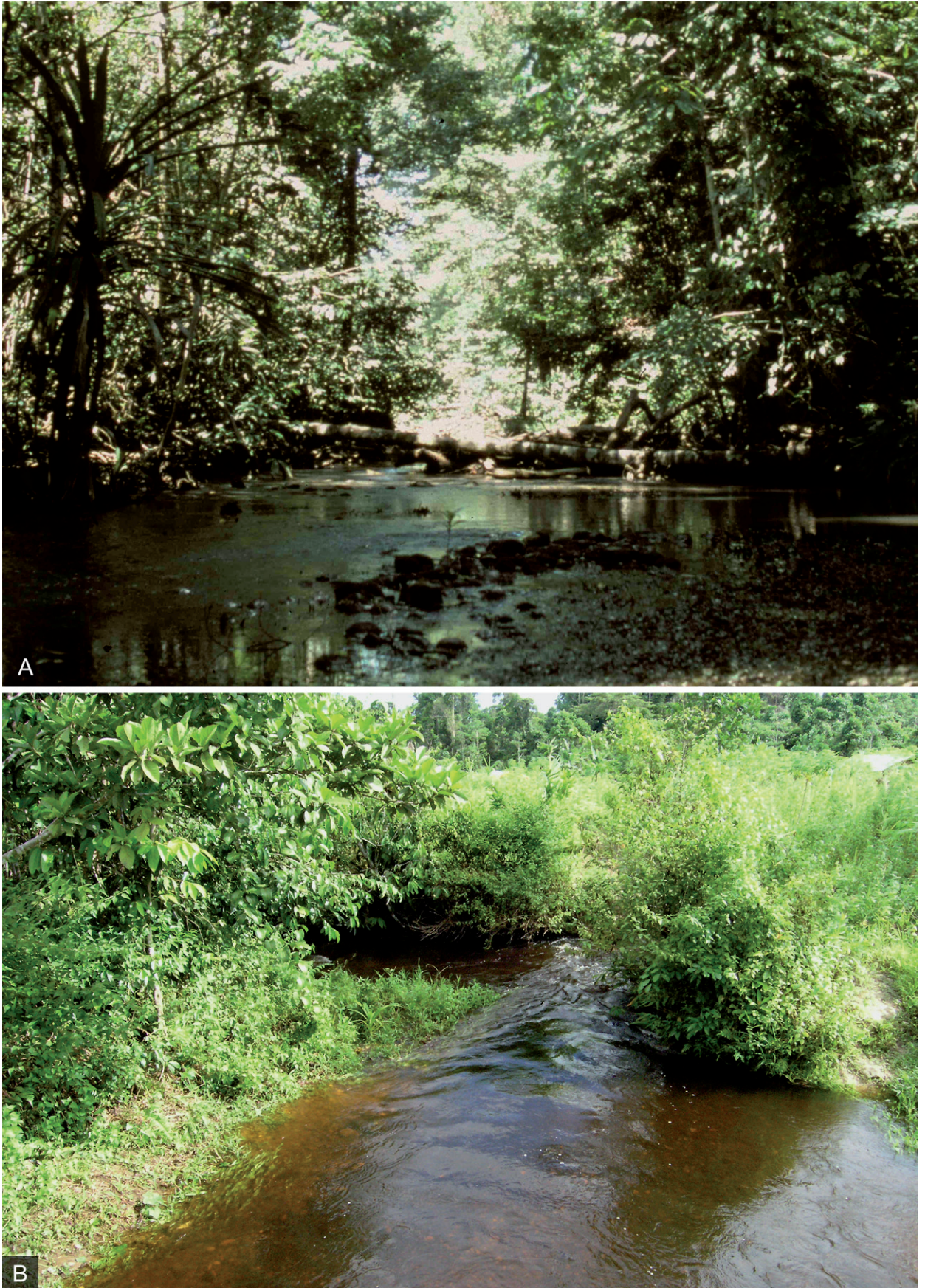
Fig. 2. Cryptocoryne versteegii var. jayaensis – A: habitat of dense stands (bottom right) in slow-flowing water at type locality in forest at Kali Kopi; B: habitat W of Timika showing forest clearing.