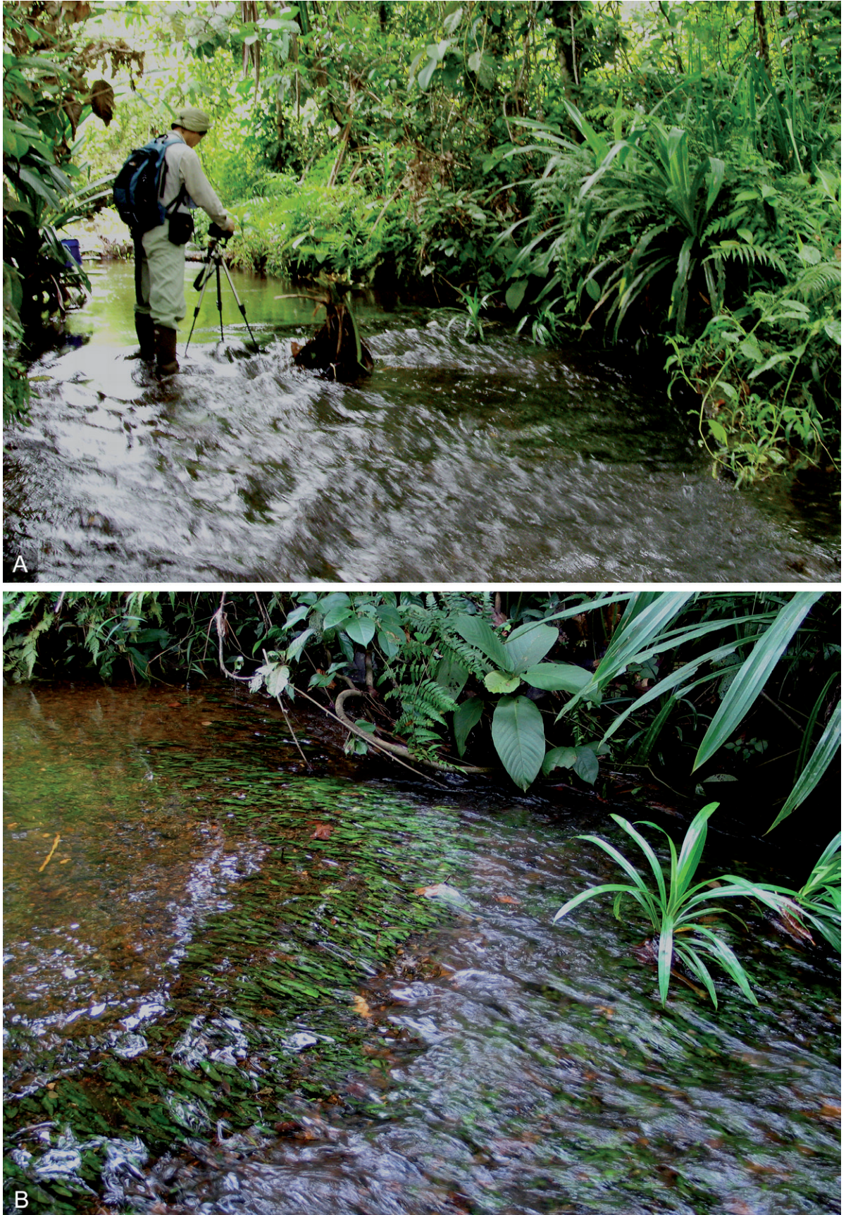
Fig. 3. Cryptocoryne versteegii var. jayaensis , habitat W of Timika – A: showing secondary tree growth along stream; B: showing photograph taken in A.