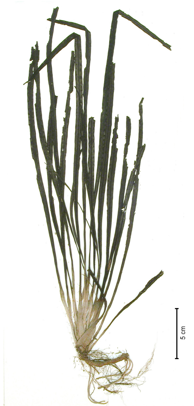
Fig. 3. Cryptocoryne crispatula var. tonkinensis – China, Guangxi Province, tributary of Beilun River near village of Na Liang, H. Zhou 05-04-3 (L).

Zhou & al. (2010) also found another form of Cryptocoryne crispatula with long narrow undulate-crispate leaves occurring in a small stream north of Dongxing, also in Guangxi Province, which was then also referred to var. flaccidifolia . Based on our present observations we would now also refer this gathering to var. tonkinensis (Na Suo River, 30 Jan 2010, H. Zhou ZH2010-2 [= B 1353 ],