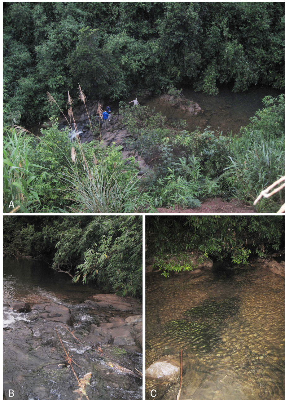
Fig. 1. Cryptocoryne crispatula var. tonkinensis – A: habitat showing stream running in granite bedrock in gully; B: descent to water shown in A; C: pool with large patch of submerged plants. – Vietnam, Quang Ninh Province, W of Hai Ha, Cau Khe Heo, 130 m, 15 Dec 2013, photographs by M. Ørgaard.

Several people have dealt with the identity of var. tonkinensis over the years. Mühlberg & Hertel (2007) dealt with all the classical collections from Vietnam in a detailed morphological, phenological and nomenclatural study.