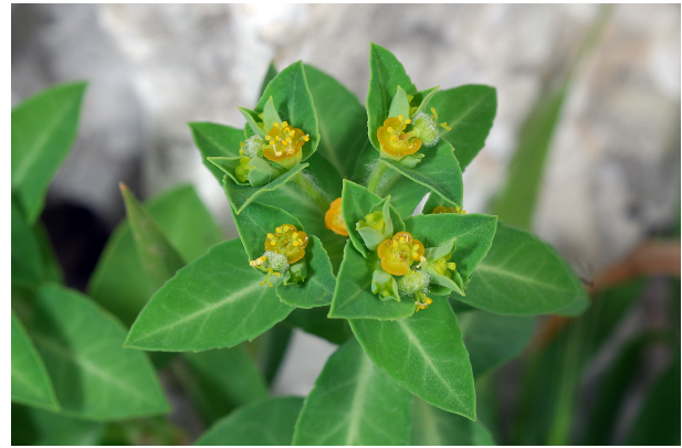
Fig. 3. Euphorbia berythea , flowering stem. – Cyprus, Sotira, near Agios Antonios (Ammochostou), 9 Mar 2008, photograph by C. S. Christodoulou.

Second published record for Cyprus (see Hadjikyriakou 2009 for the other record and Meikle 1977 on earlier unsubstantiated records). To be classified as naturalized non-