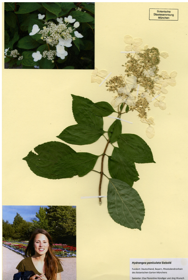
Fig. 3. Collecting local plants, either as a component of courses in the life sciences or as an interesting hobby, can be made more attractive by adding photos, including of the collectors, the plant's habitat, or morphological details.