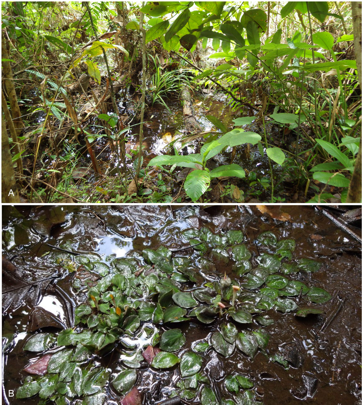
Fig. 2. Cryptocoryne aura – A: habitat at type locality with slower-flowing water; B: close-up of plants in A. – Photographed on 26 February 2015 by S. Wongso.

Etymology — The epithet alludes to the well-developed, slightly transparent, whitish membrane surrounding the leaf margin, which is likened to an aura.