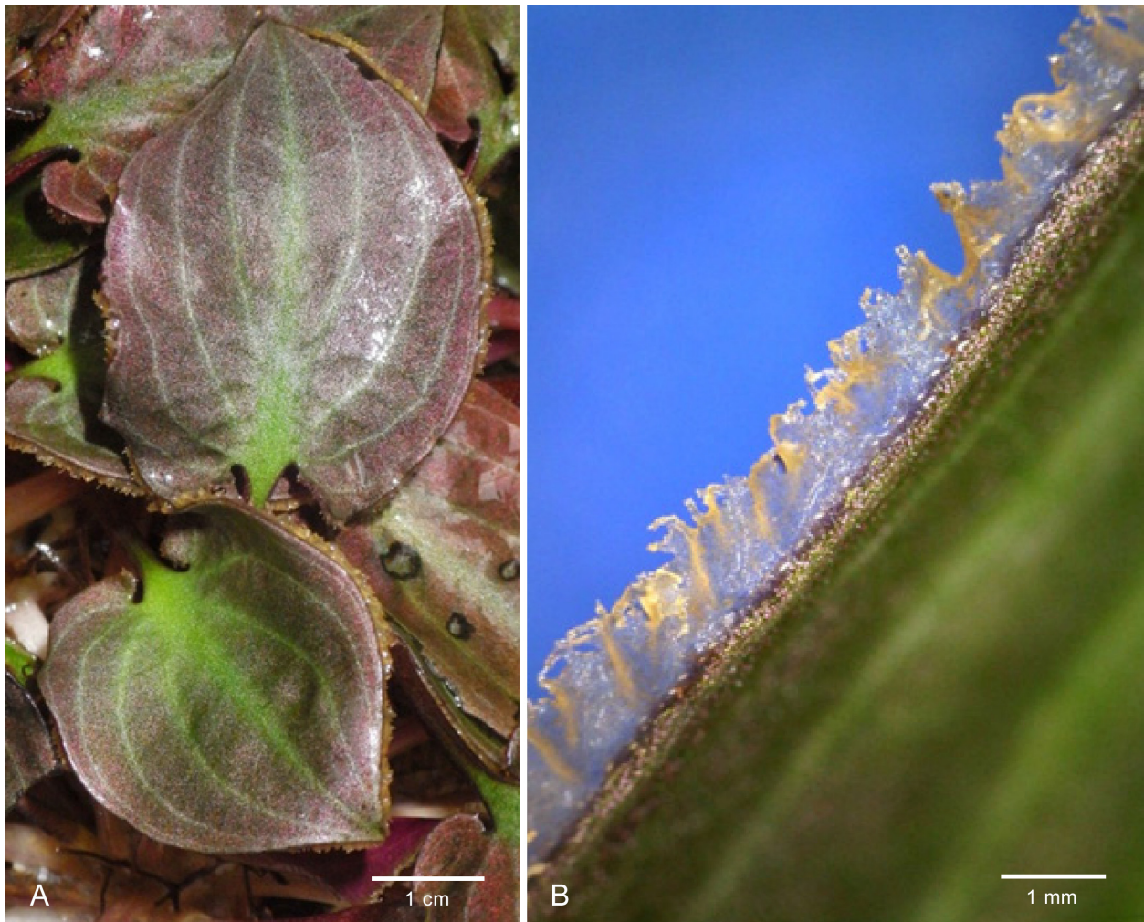
Fig. 4. Cryptocoryne aura – A: leaf showing surface patterns and transparent margin; B: close-up of transparent margin (the “aura”) with ciliate trichomes. – Photographs by S. Wongso.

viously been reported for Cryptocoryne , and from this number alone it is not possible to say anything about relationships (Arends & al. 1982). The basal chromosome numbers of x = 10, 11, 15, 17 and 18 have been recorded for Bornean species; x = 10 has been found in the Bornean C. hudoroi Bogner & N. Jacobsen, C. ideii , C. keei N. Jacobsen and C. striolata Engl.; x = 11 has been found in the widespread SE Asian C. ciliata ; and x = 14 has been found in the Sri Lankan group around C. beckettii Thwaites ex Trimen. However, the morphology and the chromosome number together do not provide any clue as to relationships between C. aura and other Cryptocoryne species.