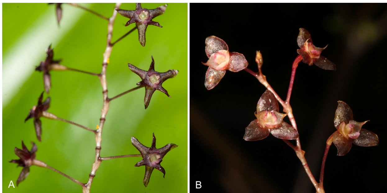
Fig. 4. Flowers of Stelis machupicchuensis (A) and Stelis antennata (B). Note the morphological differences of their lips. Both specimens from the same locality: Wayqecha Biological Station.