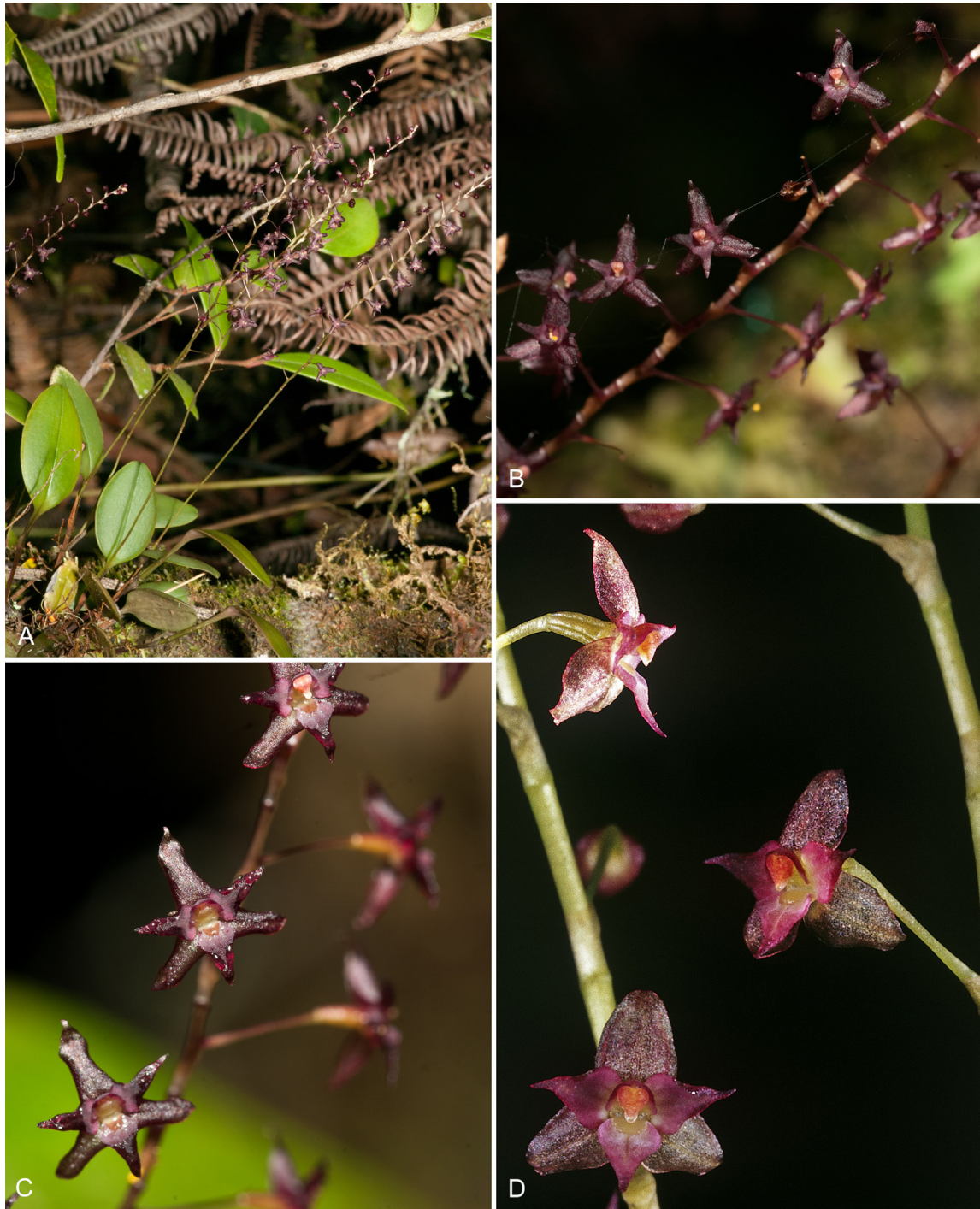
Fig. 2. Stelis machupicchuensis – A: habit of plant; B, C: segments of an inflorescence; D: flowers in close-up. – Photographs: A–C by J. Farfán based on Martel & Farfán 73 (USM!); D by B. Collantes based on the holotype.

2700 m, 20 Mar 2016, C. Martel & J. Farfán 73 (USM!) [Fig. 2A–C].