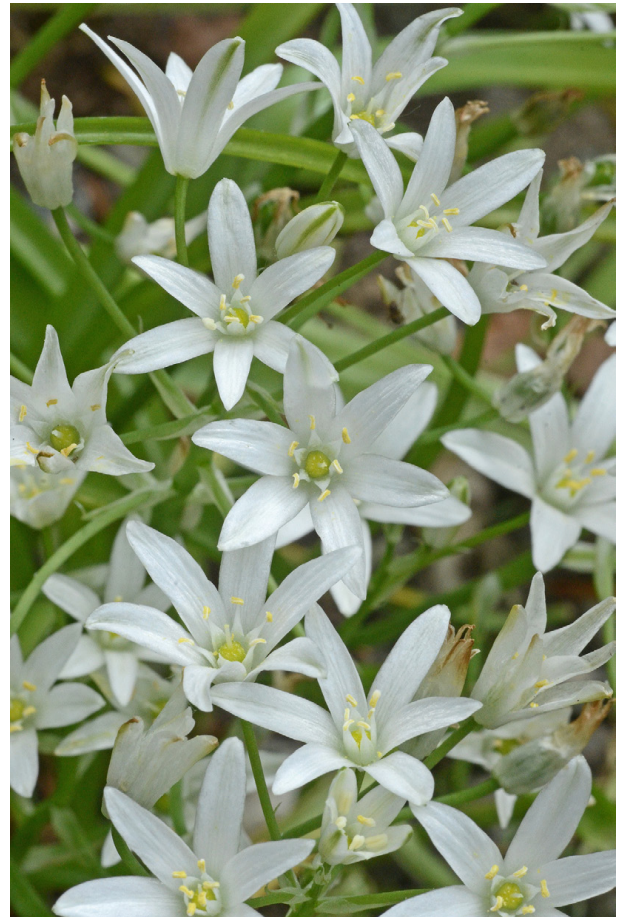
Fig. 3. Ornithogalum naxense – cultivated in Ørbæk, Denmark, 23 May 2017, photograph by A. Strid; collected from Greece, nomos of Kiklades, Naxos, N side of Mt Koronos, 600 m, 28 May 2013 (Strid 57773).

Close examination of living material of Ornithogalum dictaeum subsp. naxense revealed a number of features which make it reasonable to regard it as a separate, endemic species. The main differences between the two species are summarized in Table 1, and an amended description is given above. A. Strid