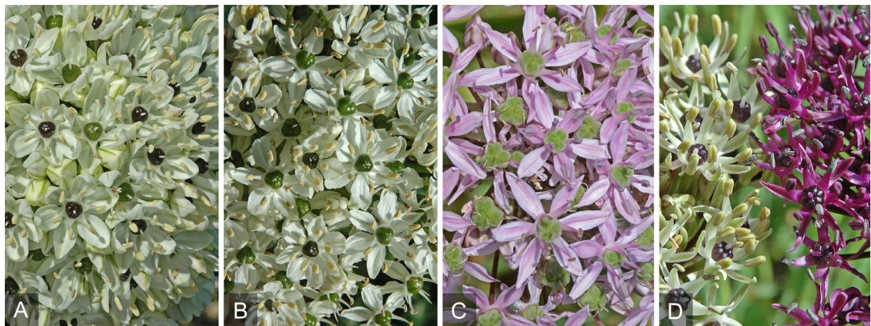
Fig. 1. Comparison of flowers of Allium melanogyne , A. nigrum and A. cyrilli from Greece. – A: Allium melanogyne , cultivated in Ørbæk, Denmark, 28 Jun 2012; collected from nomos of Evros, eparchia of Soufli, by ecotouristic station near village of Dadia, 100 m, rocky outcrop, 31 May 2010, Strid 57037 (G, herb. Strid). – B: Allium melanogyne , cultivated in Allerød, Denmark, later in Göteborg Botanical Garden, Sweden, 28 Jun 2006; collected from island of Lesvos, eparchia of Mitilini, 2–3 km from Sanatorio Agiasou along road to Plomari, 700–800 m, open Castanea forest and meadows, 27 Apr 1987, Strid & al. G87-67 (bulb collection). – C: Allium nigrum , island of Samos, 1 km from Chora toward Pythagorion, 40 m, traditionally cultivated field with many weeds, 19 Apr 2017. – D: Allium cyrilli , colour forms growing side by side; island of Chios, just NE of village of Kalimasia, 100–150 m, loamy hills with terraced mastic and olive groves, 25 Apr 2009. – not shown at same scale.

In addition to Allium nigrum and A. melanogyne , a third member of A. sect. Melano-