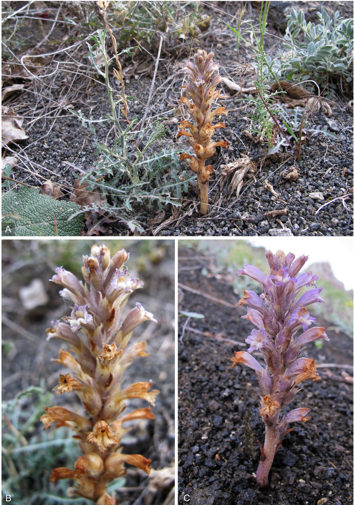
Fig. 6. Phelipanche sinaica . – A: flowering plant in habitat with host, Lactuca cf. viminea ; B: flowering spike; C: habit of flowering plant. – A, B: Azerbaijan: Talysh, NE side, near Şonaçola, 26 May 2013; C: Azerbaijan: Talysh, c. 2 km NE of Mistan, 27 May 2013; all photographs by S. Rätzel.