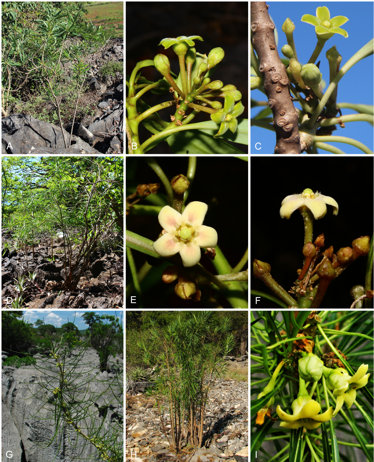
Fig. 2. Marsdenia calcaria : A: habit; B, C: inflorescence with buds and open flowers, lateral view. – Marsdenia phallica : D: habit; E: flower, apical view; F: flower, lateral view. – Marsdenia breviramosa : G: branch with leaves and inflorescences. – Marsdenia zehntneri : H: habit; I: inflorescence with buds and open flowers, lateral view.