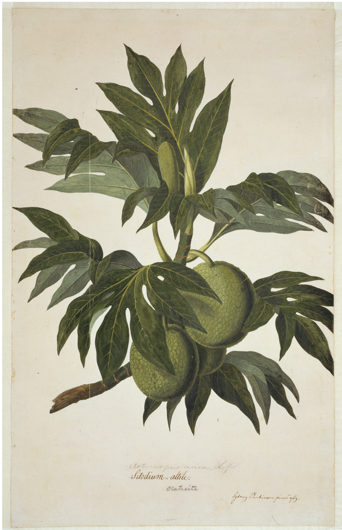
Fig. 3. Lectotype of Sitodium altile Parkinson ( \equiv Artocarpus altilis (Parkinson) Fosberg). Finished watercolour by Sydney Parkinson of the breadfruit tree (as Sitodium altile ), made at Otaheite (Tahiti) in 1769 during James Cook's first voyage.