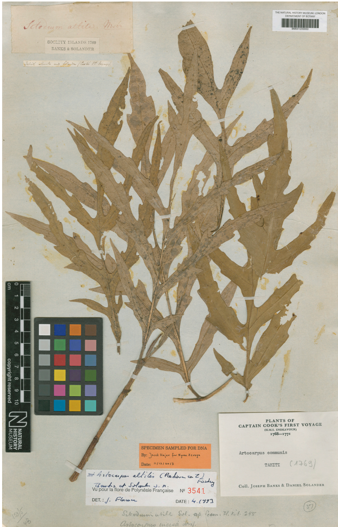
Fig. 2. Specimen of Artocarpus altilis, showing two branches with three leaves, collected by Banks & Solander in 1769 in Tahiti, preserved in BM (barcode BM001209950).