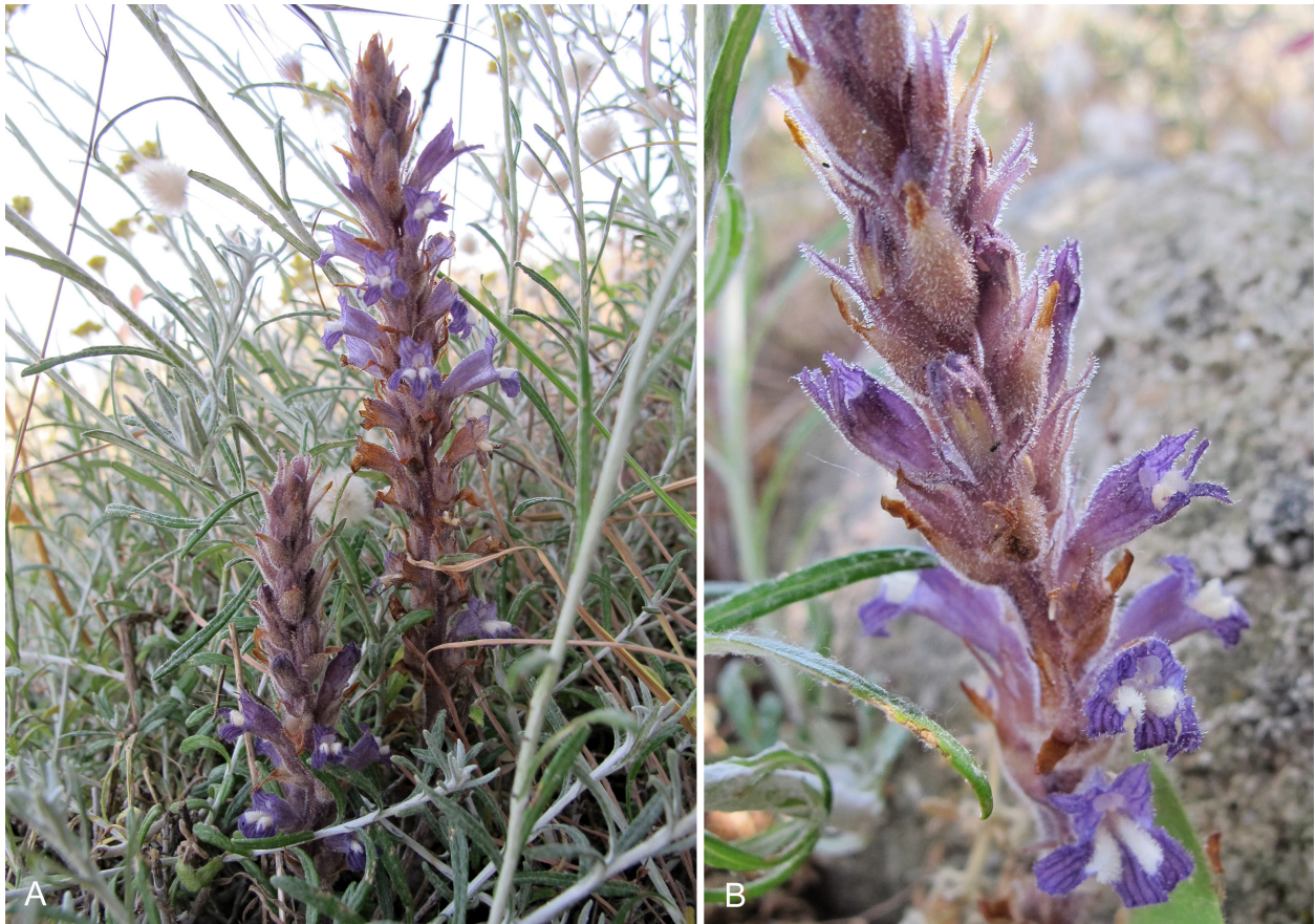
Fig. 9. Phelipanche orientalis – A: habit of plants, B: inflorescence detail. – Greece: Rodos, near Agios Isidoros, 26 May 2014.

1986: 448). Meikle (1985: 1237) gave as host for the plants from Cyprus “ Prunus dulcis , Medicago spec. , Astragalus lusitanicus , etc.” Phelipanche orientalis can also be very abundant in plantations of Prunus armeniaca L. (apricot), e.g. in Turkey, prov. Malatya, 2013, Aksoy & Pekcan, as Phelipanche aegyptiaca (Pers.) Pomel (photo [Aksoy & Pekcan 2014: 31]). The species probably occurs also on other members of Prunus sect. Amygdalus , but has been misidentified (Schiman-Czeika 1964: 1ff.; Musselmann 1980: 463ff.; Riches & Parker 1995: 226ff.; Saeidi Mehrvarz & al. 2010: 113; Sánchez Pedraja & al. 2016+).