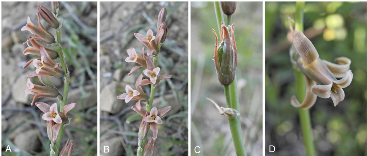
Fig. 2. A–C: Dipcadi fulvum ; A, B: inflorescences showing flowers with brownish reddish tepals; C: immature capsule. – D: Dipcadi serotinum , flower with brownish yellowish tepals. – Tunisia: Nabeul, Hammamet south, Hammam Bent Jedidi, 27 Mar 2014, photographs by R. El Mokni.

an area of c. 300 m 2 within watercourses and swamps and seem to be recently introduced, possibly by birds. They may have been overlooked or misidentified in the past.