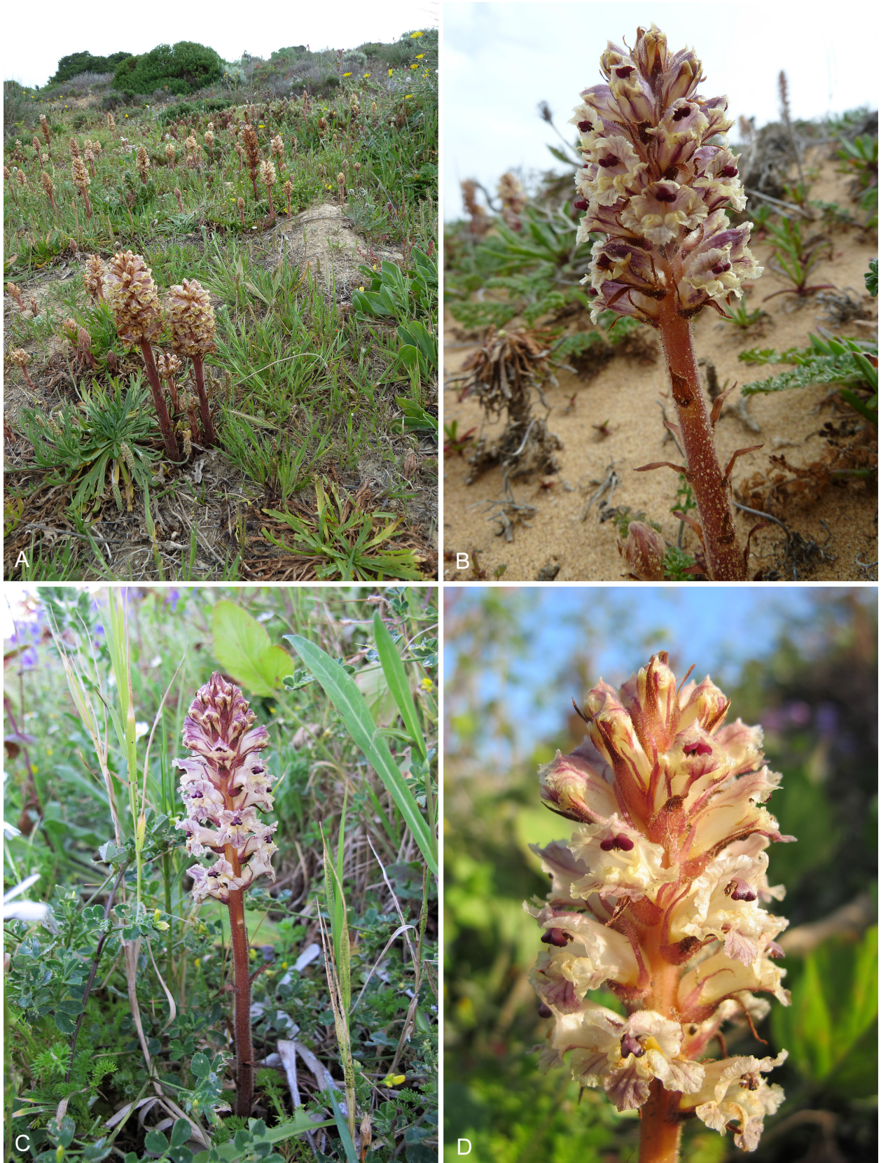
Fig. 6. Orobanche litorea – A: habit of plants with host Plantago coronopus s.l.; B: inflorescence detail; A, B: Portugal: Algarve, dunes near Carrapateira, 12 Apr 2015, photographs by V. Holzgreve. – C: habit of plant with host Anthemis maritima (bottom left); D: inflorescence detail; C, D: Italy, Sicily: coastal dunes near Portopalo, 14 Mar 2016, photographs by B. Kreinsen & S. Rätzel.