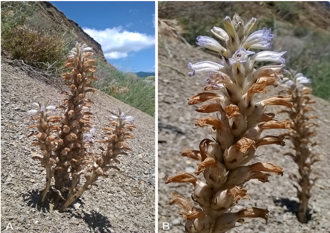
Fig. 8. Phelipanche kelleri – A: habit in late flowering and early fruiting stage; B: detail, upper part of inflorescence. – Georgia: Sarkinetis Kedi, 11 May 2017, photographs by A. Gröger.

Phelipanche orientalis (Beck) Soják (≡ Orobanchae orientalis Beck). – Fig. 9.