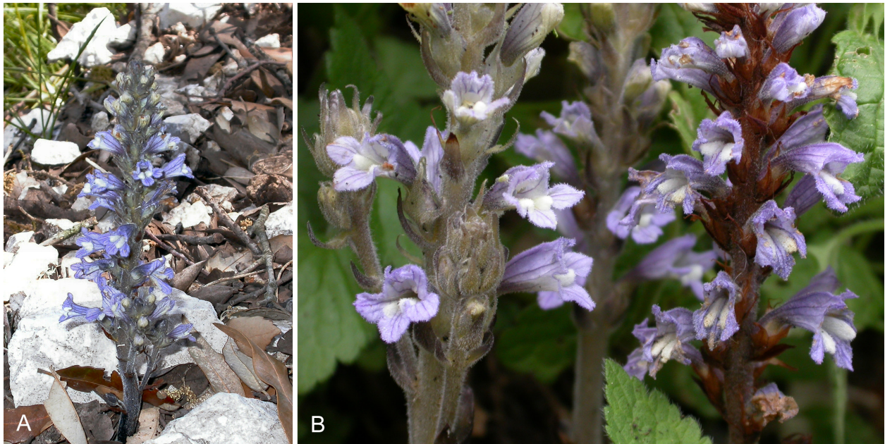
Fig. 7 Phelipanche gussoneana – A: habit of plant; B: inflorescence detail. – Italy, Sicily: Palermo, Rocca Busambra (type locality of Phelypaea gussoneana ), 20 Jun 2014, photographs by G. Domina.

panche schultzioides , including its type, and specimens from Sicily identified as Phelipanche oxyloba (Reut.) Soják (Domina & al. 2011) match Phelypaea gussoneana , including its type. For reasons of nomenclatural priority, the present new combination is necessary when Phelipanche schultzioides and Phelypaea gussoneana are regarded as conspecific. This taxon is typically taller than the morphologically similar Phelipanche mutellii (F. W. Schultz) Pomel and has a different appearance, with bracts sticking out from the inflorescence in bud, and dark bluish veins on the corolla.