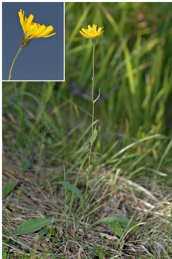
Fig. 5. Hieracium stenoglossophyllum – Serbia: Šar Planina, Ošljak, 30 Jul 2008, photographs by M. Niketić.

H. sparsum subsp. naegelianiforme O. Behr & al., from which it is distinguished by its (almost) glabrous peduncles. Š. Duraki & M. Niketić