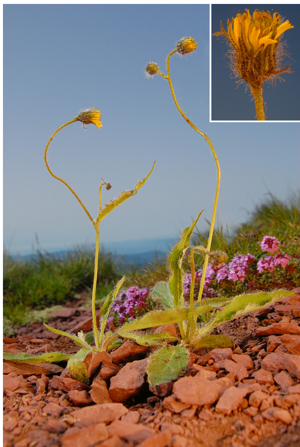
Fig. 4. Hieracium schmidtii subsp. balkanum – Serbia: Stara Planina, Žarkova Čuka (7–8 km from type locality), 5 Jul 2014, photographs by M. Niketić.