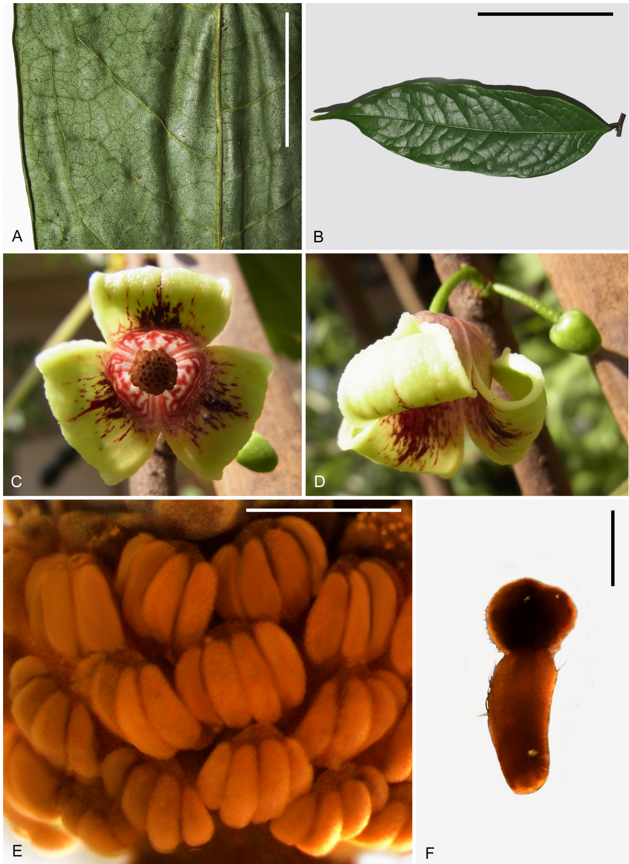
Fig. 2. Leaf and flower of Milusa chantaburiana – A: abaxial (lower) leaf surface; B: adaxial (upper) leaf surface; C: flower, apical view showing stamens, carpels, inner petal discolouration and translucent window-like structures; D: flower, oblique view showing strongly recurved apical part of inner petals; E: stamens attached to torus; F: carpel. – Scale bars: A = 2 cm; B = 10 cm; E = 1 mm; F = 0.5 mm. – A, B from cultivated material; C–F from Nakorn-Thiemchan NTC 29 (CMUB – spirit material).