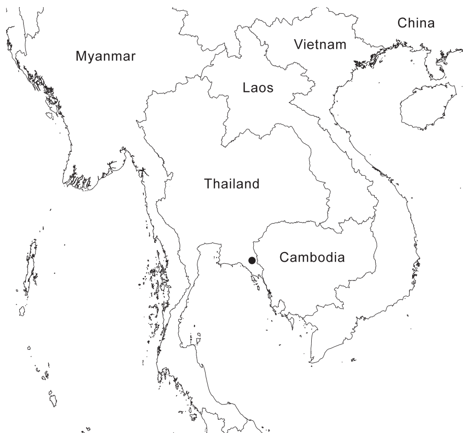
Fig. 4. Distribution of Miliusa chantaburiana (●).

Remarks — Table 1 highlights important morphological differences between Miliusa chantaburiana and two