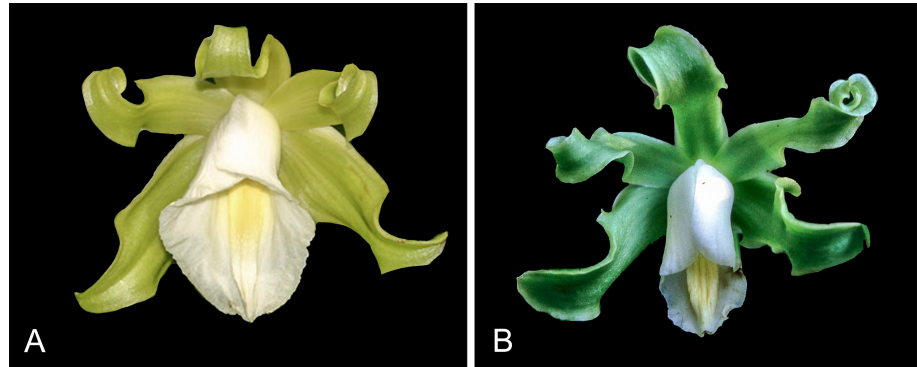
Fig. 2. Flowers of Vanilla guianensis (A) and V. mexicana (B).