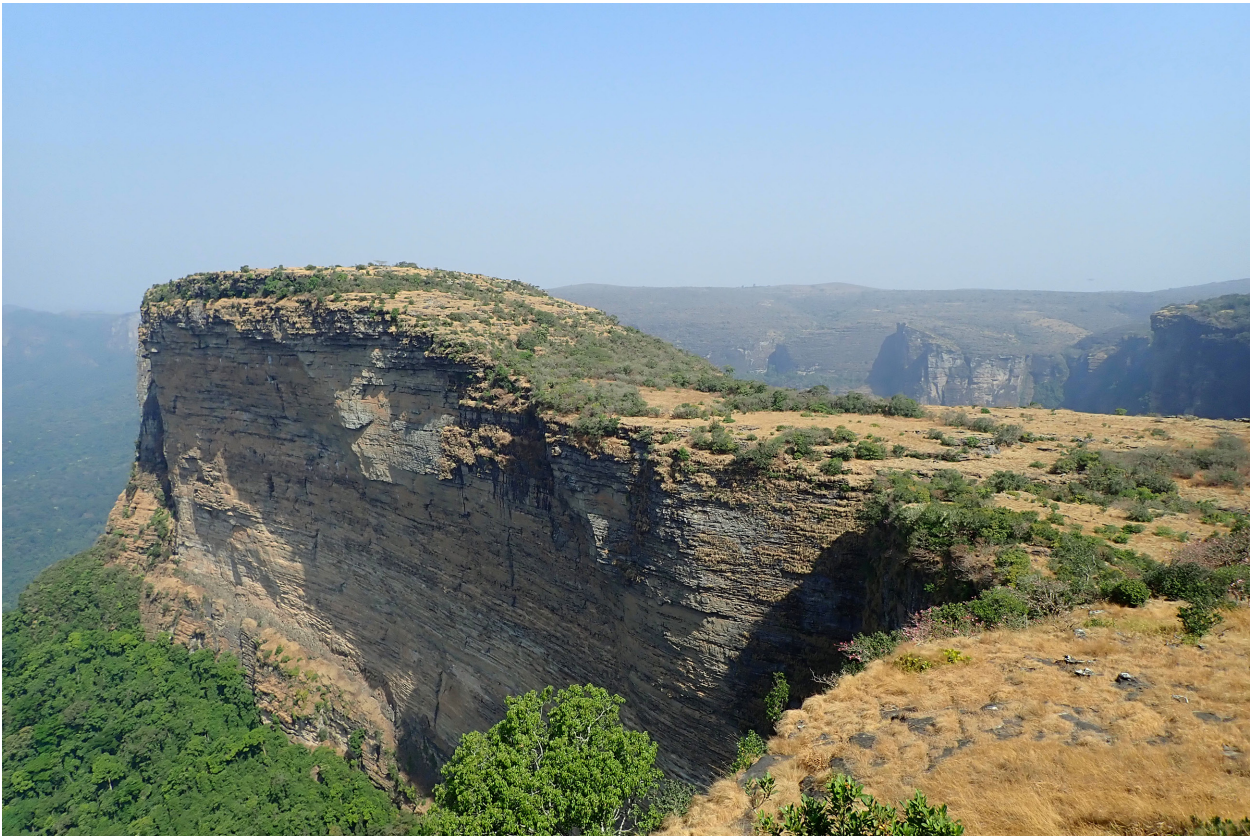
Fig. 6. Submontane wooded grassland vegetation in the Kounounkan Massif. Gladiolus mariae was collected on this 1020 m high hill and was also observed there, growing on vertical sandstone cliffs. In some years the vegetation on the hill is not subject to the annual dry season fires because it is separated from the main plateau by a narrow, 350 m long canyon.

In Afromontane shrubland, fire has often favoured the spread of grasses at the expense of the shrubs (White 1983: 49). Anthropogenic fires are usually ignited in the dry season when lightning-ignited fires would not normally occur (Archibald & al. 2012) and have a large influence on species composition and structure of the vegetation (Bond & al. 2005; Staver & al. 2011).