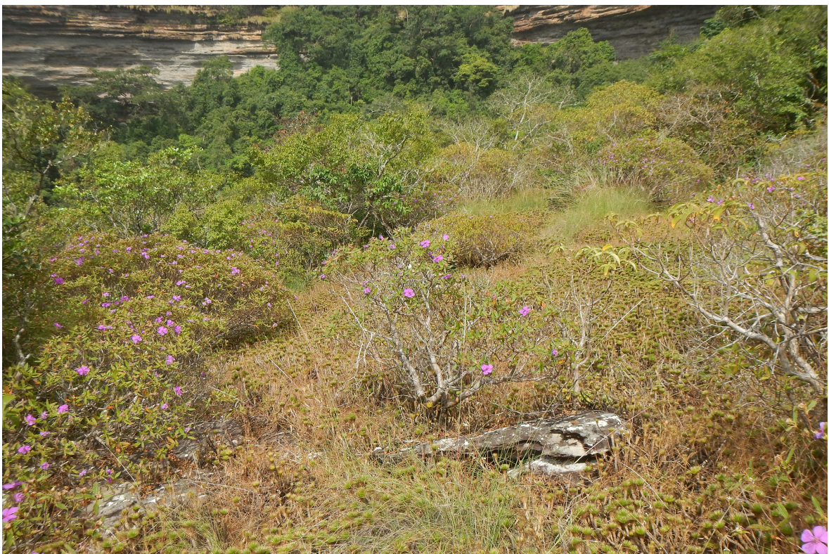
Fig. 5. Inside the submontane shrubland vegetation of Fig. 4. Gladiolus mariae occurs abundantly in this vegetation type. The vegetation is dominated by shrubs that are not resistant to fire: Cailliola praerupticola (in flower), Dissotis leonensis (both Melastomataceae) and Microdracoides squamosa (Cyperaceae). Grasses (Poaceae) are infrequent; the only grass visible is Rhytachne perfecta , front and centre right.