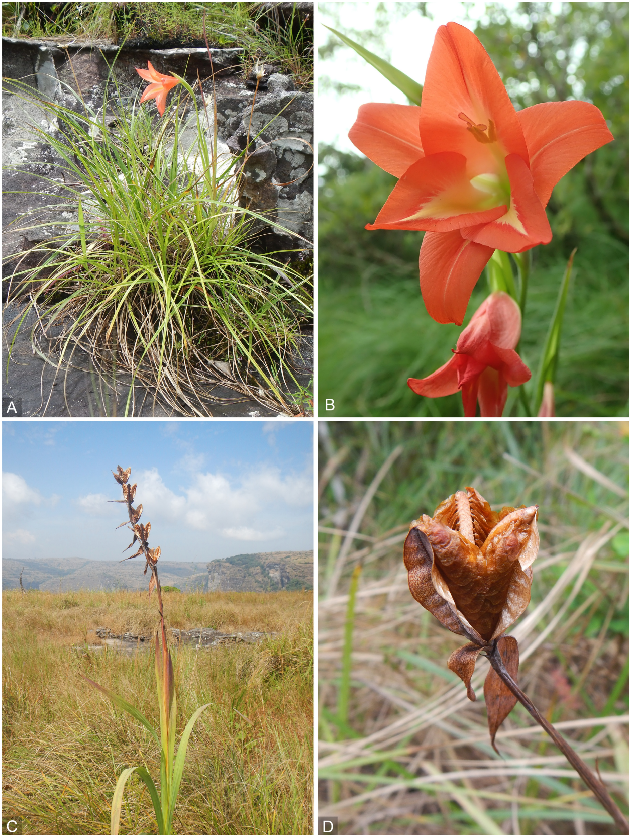
Fig. 1. Gladiolus mariae – A: habit of flowering plant; B: flowers; C: fruiting plant; D: fruit. – Origin: A from Burgt & Haba 2012 (type gathering); B from Burgt 2207 ; C, D from Burgt 2161 . – All photographs by Xander van der Burgt.