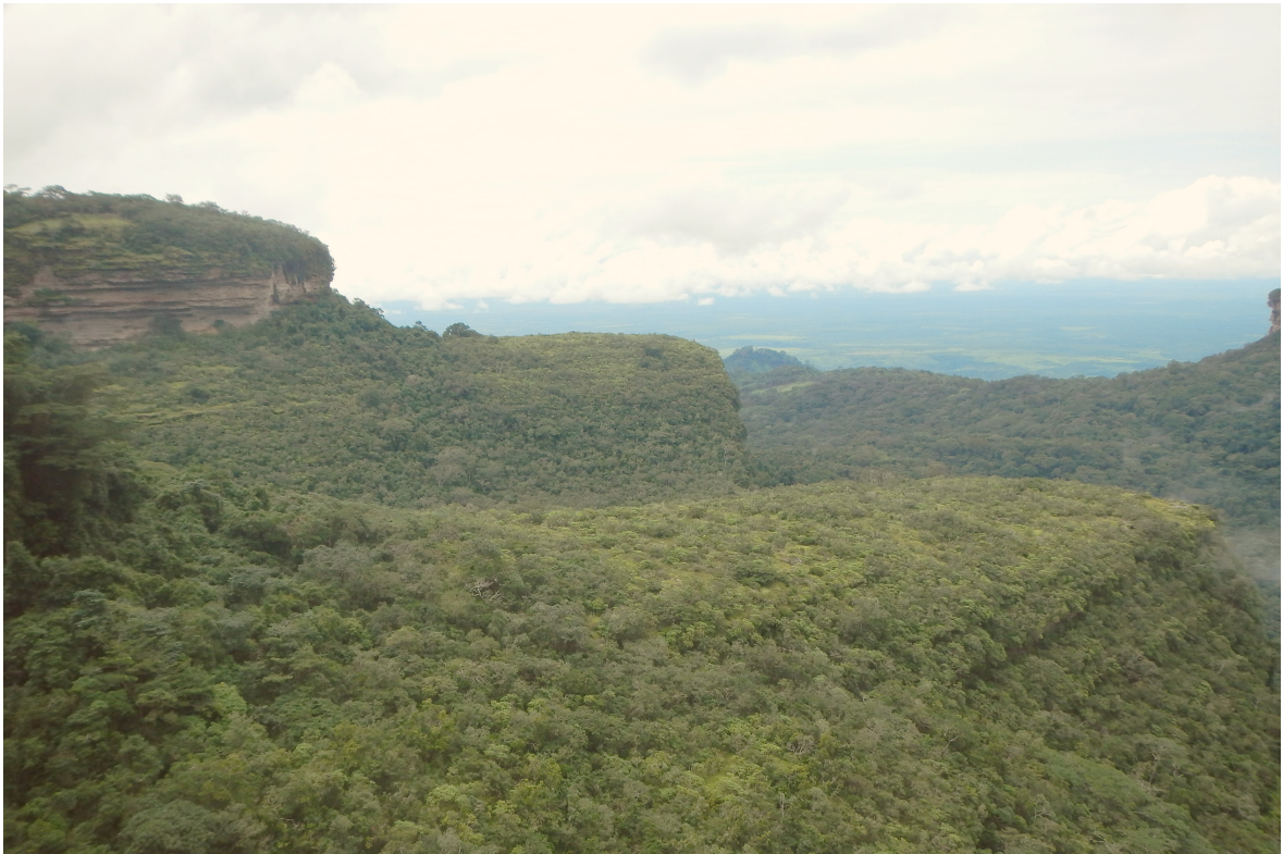
Fig. 4. Submontane forest and shrubland vegetation at 850 m altitude in the Kounounkan Massif. Both vegetation types are dominated by species that are not resistant to fire. The shrubland vegetation blends gradually into the surrounding submontane forest. – Photograph taken on 25 Sep 2016 by Xander van der Burgt.