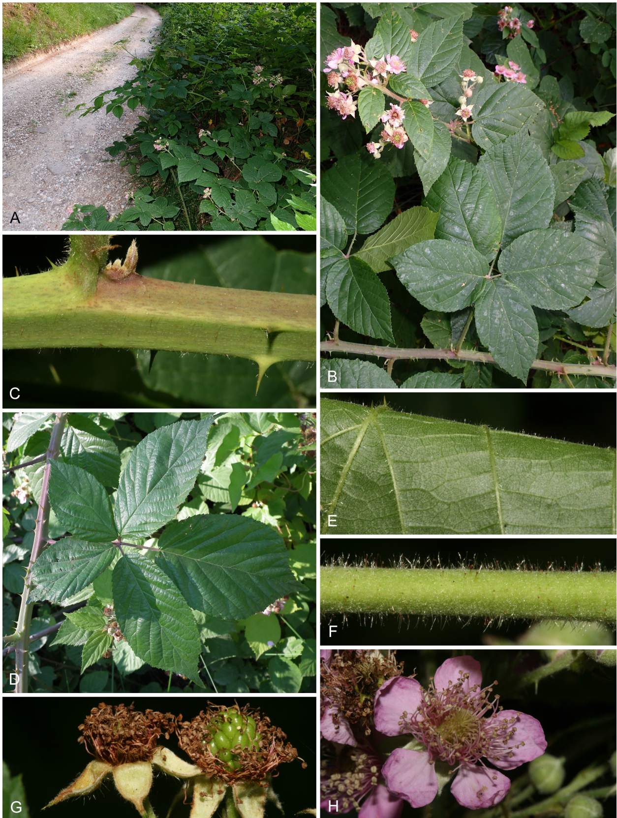
Fig. 2. Rubus vallis-cembrae – A: typical stand in a forest fringe; B: leafy first-year stem and inflorescence; C: first-year stem; D: typical leaf of first-year stem; E: underside of leaf of first-year stem; F: axis of inflorescence; G: young collective fruits; H: flowers. – A–C & E–H: Val di Cembra, near Rio di Lona, 1 Jul 2018, photographed by Filippo Prosser; D: Val di Cembra, 1 km SW of Albiano (type locality), 30 Jun 2018, photographed by Gergely Király.