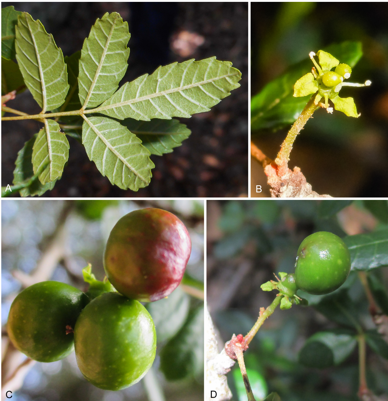
Fig. 2. Picrasma pauciflora – A: leaf showing number of leaflets and their abaxial surface; B: bisexual flower with tiny, immature fruits; C: drupaceous mericarps; D: drupaceous mericarp in lateral view, showing gynophore developed from intrastaminal disk. – All photographs taken at: Cuba, Holguín, Rafael Freyre, Loma El Templo, 23 May 2017; A, B: by José Luis Gómez-Hechavarría; C, D: by Pedro A. González-Gutiérrez.

Picrasma pauciflora A. Noa & P. A. González, sp. nov. – Fig. 1, 2.