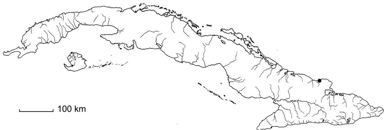
Fig. 3. Map showing distribution of Picrasma pauciflora (●) at Loma El Templo in Holguín province, Cuba.

opposite, subsessile, 1–1.5 × 0.5–0.7 cm, base cuneate, margin dentate (with 6–14 pairs of small teeth), slightly revolute, apex acute; terminal leaflet 1.8–2.5(–3.5) × 0.5–1(–1.5) cm; venation pinnate, reticulate abaxially, midvein and secondary veins conspicuous on both surfaces, prominent abaxially, secondary veins in 6–14 pairs, scattered hairs present on midvein and secondary veins on both surfaces, but more abundant on midvein abaxially, glabrescent. Inflorescence a 2–4-flowered cyme; pedicels 2.5–3 mm long, pubescent. Flowers bisexual or staminate; bisexual flowers 4- or 5-merous, c. 3 mm in diam.; sepals green with apex reddish, obovate-spatulate, ≤ 1.2 mm long, densely pubescent abaxially, margin dentate; petals green, ± obovate-spatulate, 1.8–2 × c. 1.2 mm in widest part, glabrous; stamens as many as petals (4 or 5); filaments inserted on intrastaminal disk, c. 1.2 mm long, glabrous; anthers dorsifixed, yellow, c. 0.4 × 0.3 mm; ovary apocarpic (Fig. 2B); style fused; stigmas free. Staminate flowers not seen. Fruits 1–3(–5) free, drupaceous mericarps, each mericarp turning red when ripe (Fig. 2C), globose, c. 6 mm in diam.,