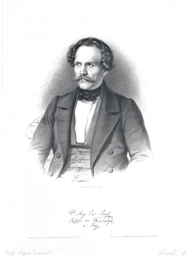
Fig. 1. August Emanuel Reuss (1811–1873), portrait.