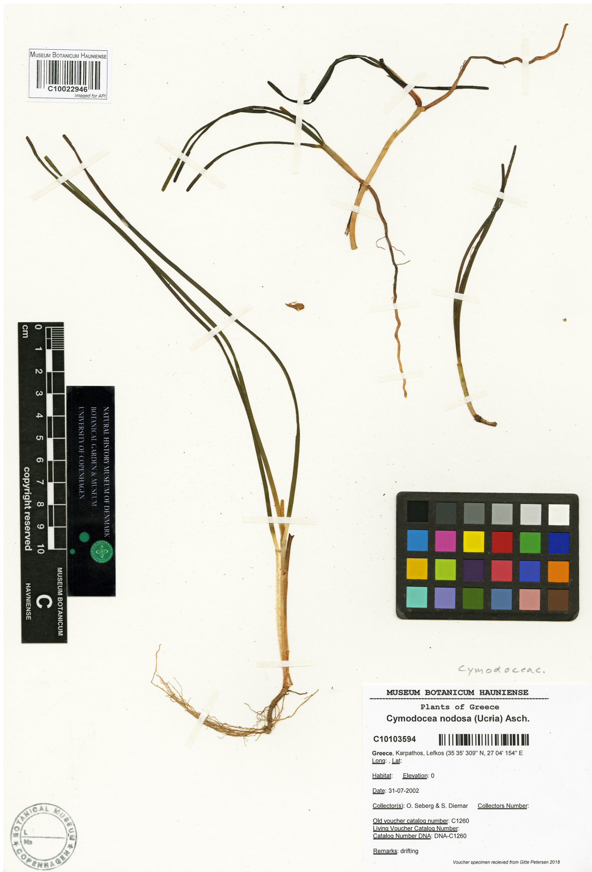
Fig. 2. Epitype of Zostera nodosa ( \equiv Cymodocea nodosa ) in C (barcode C10103594).