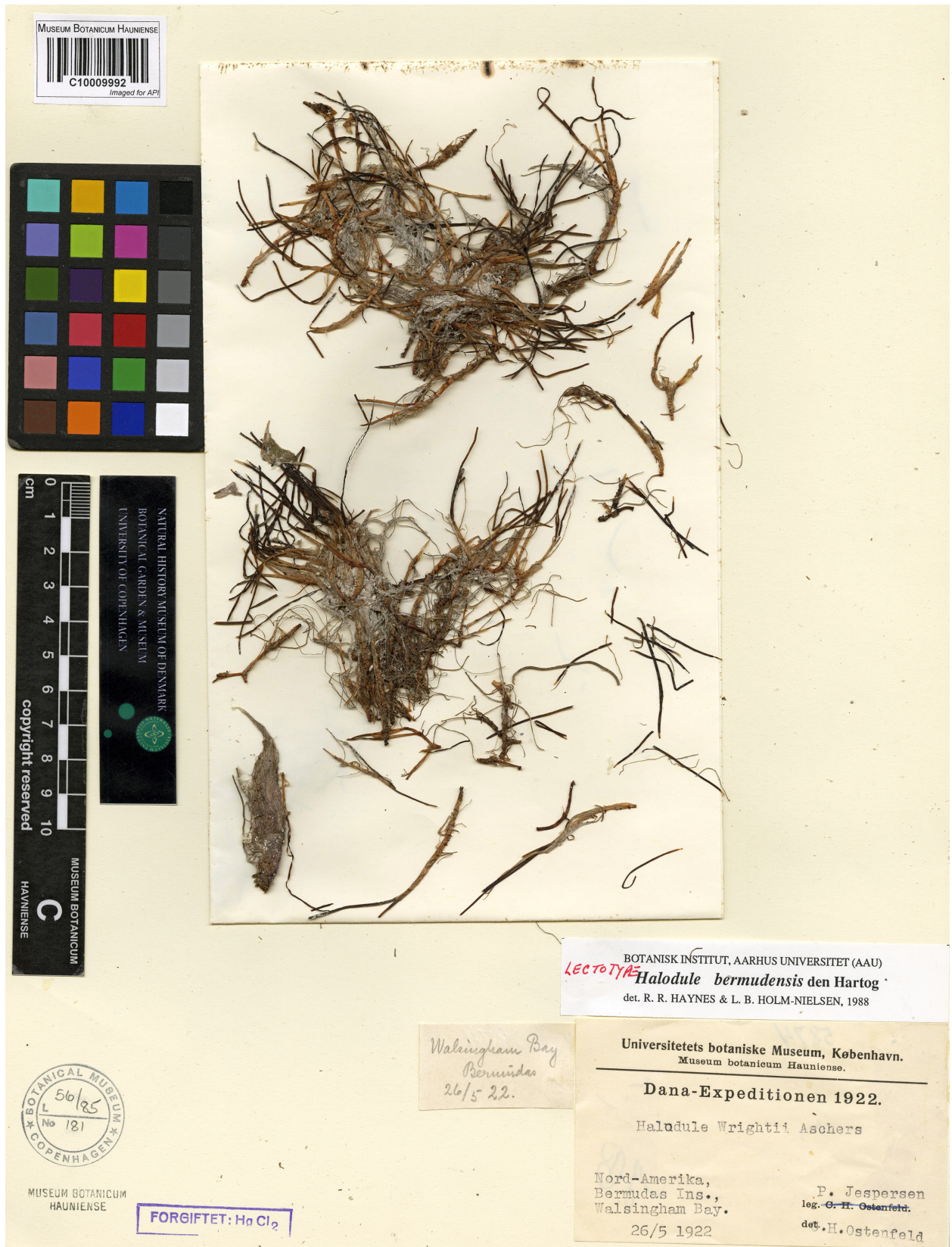
Fig. 4. Lectotype of Halodule bermudensis in C (barcode C10009992).