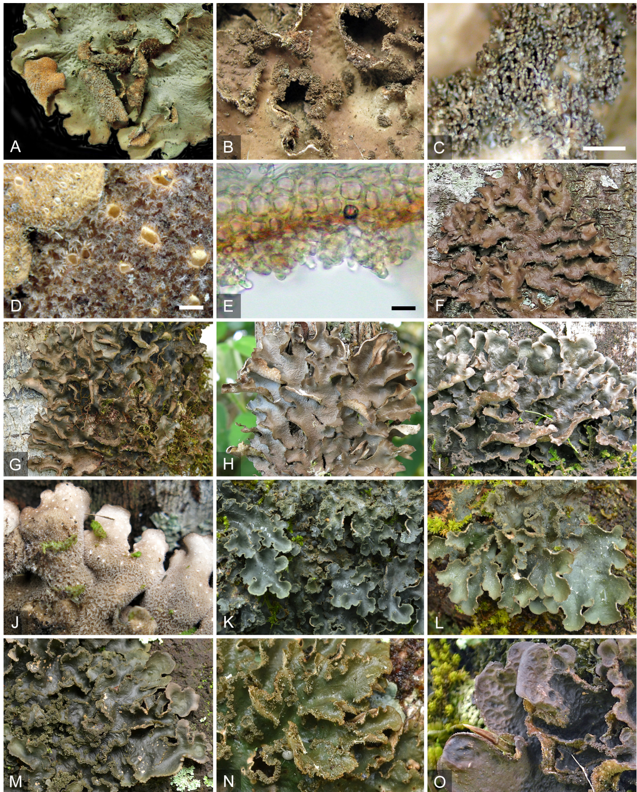
Fig. 3. Sticta scabrosa , morphology and anatomy. – A–L: S. scabrosa subsp. scabrosa ; M–O: S. scabrosa subsp. hawaiiensis ; A: thallus lobes (Colombia, Moncada 4310); B: lobes with phyllidia (Colombia, Moncada 4403, holotype); C: phyllidia enlarged (Colombia, Moncada 4403, holotype); D: lower tomentum with cyphellae (Colombia, Moncada 4403, holotype); E: section showing lower tomentum (Colombia, Moncada 4403, holotype); F–O: specimens in situ, in part showing lower tomentum with cyphellae (F: Colombia, Cauca, Moncada 7357; G: Costa Rica, Lücking 34607; H: Colombia, Cauca, Moncada 7366; I–K: Brazil, Lücking 40042; L: Brazil, Lücking 40087; M–O: Hawaii, Moncada & al. 6937, 7011, 7015). – Scale bars: C, D = 1 mm; E = 10 \mu m.