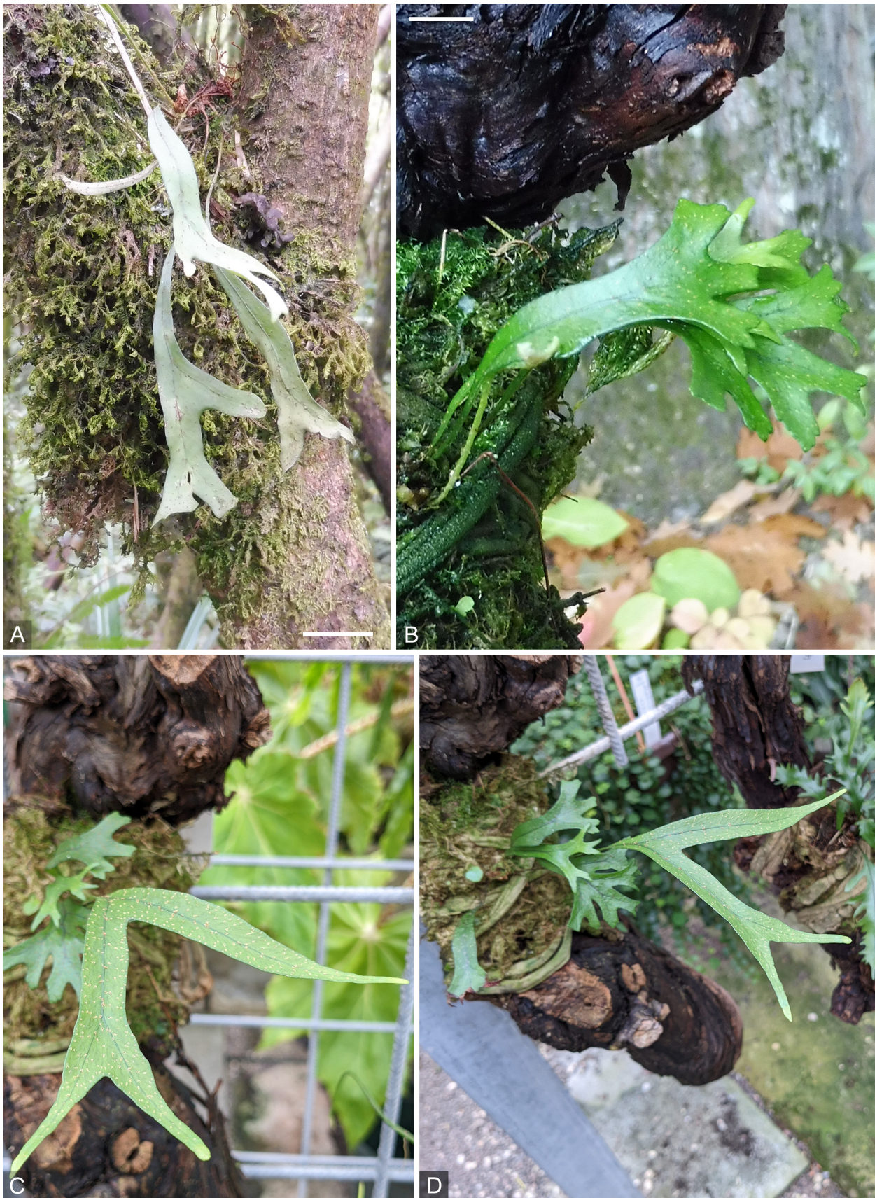
Fig. 3. Habit of Pleopeltis macrocarpa var. dichotoma , E. Fischer s.n. – A: Rwanda, Mt Gahinga, 20 Mar 2022, photograph by and © Eberhard Fischer; B–D: Germany, in cultivation in Botanical Gardens Bonn, photographs by and © Eberhard Fischer and Wolfram Lobin. – Scale bars: A, B = 1 cm.