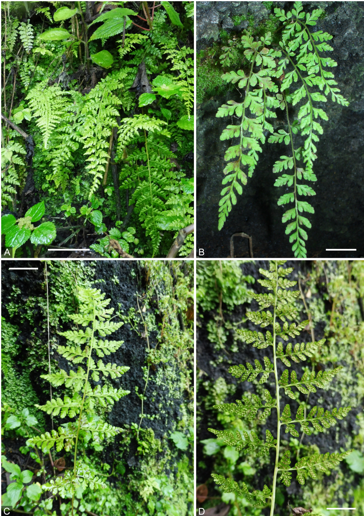
Fig. 1. Cystopteris diaphana , E. Fischer s.n. – A, B: habit; C: frond, adaxial view; D: frond, abaxial view. – A–D: Rwanda, foot of Mt Bisoke, 22 Sep 2022, photographs by and © Eberhard Fischer. – Scale bars: A = 5 cm; B–D = 1 cm.