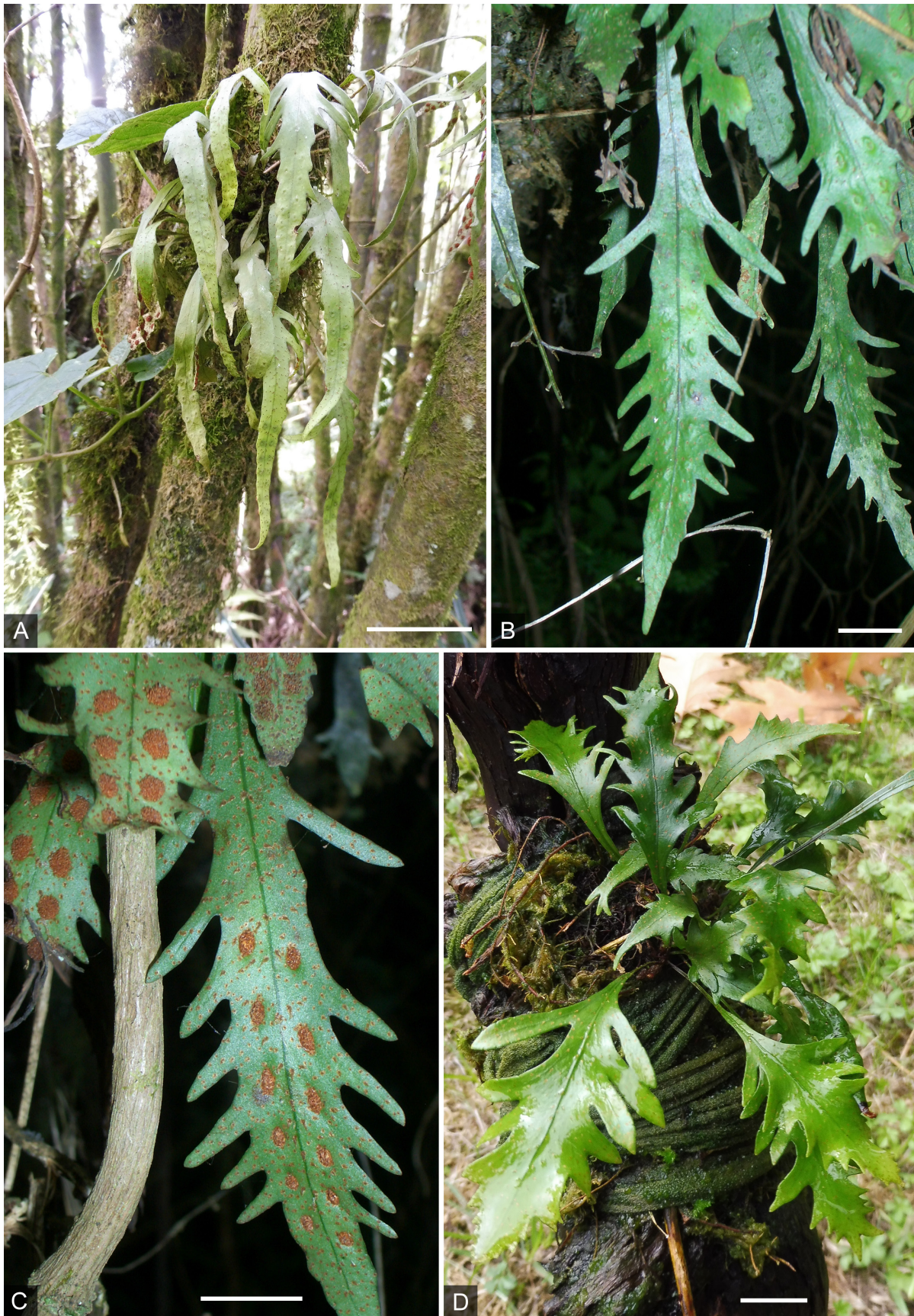
Fig. 4. Pleopeltis macrocarpa var. pinnatiloba , E. Fischer s.n. – A, B, D: habit; C: frond. – A–C: Rwanda, Mt Gahinga, 20 Mar 2022 (A), 5 Oct 2006 (B, C); D: Germany, in cultivation in Botanical Gardens Bonn. – Scale bars: A = 5 cm; B–D = 1 cm.