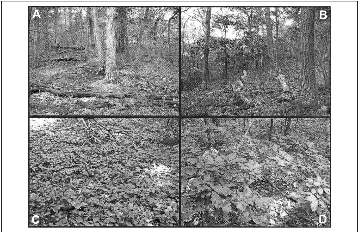
Figure 2. From top left to bottom right- A) July 2011 overview of the spring 2011 prescribed fire in the forest understory at Glory Hill 2 site; B) Red oak and chestnut oak dominated forest at the unburned Oakwood 3 study site; C) Large cohort of red oak seedlings that germinated after the April burn in Old Minnewaska 2 site following a mast year in 2010; D) Large seedling sprouts of red oak and chestnut oak (in 2011) created after the 2009 fire on the Oakwood 2 site.