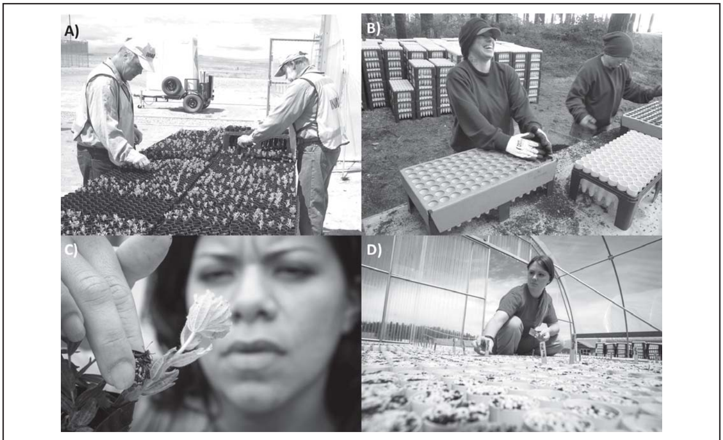
Figure 2. Prison inmate technicians participating in conservation projects. (A) Adults in custody cultivating sagebrush ( Artemisia tridentata ) at Snake River Correctional Institution near Ontario, Oregon. Plants produced at this facility are planted by inmate work crews at restoration sites to improve habitat for greater sage-grouse ( Centrocercus urophasianus ) (photo by Stacy Moore). (B) Production of early blue violet ( Viola adunca ) at the Coffee Creek Correctional Facility to support habitat restoration and feeding of captive reared Oregon silverspot butterflies ( Speyeria zerene hippolyta ) (photo by Thomas Kaye). (C) An inmate with SPP-Washington Taylor's Checkerspot Captive Rearing Program at Mission Creek Corrections Center for Women holds an endangered Taylor's checkerspot butterfly ( Euphydryas editha taylori ) next to golden paintbrush ( Castilleja levisecta ) during a study of the butterfly's oviposition preferences (photo by Benj Drummond). (D) An inmate technician labels native prairie plants for the SPP-Washington Conservation Nursery Program at Washington Corrections Center for Women (photo by Benj Drummond).

Coffee Creek Correctional Facility for women, a medium- and minimum-security prison in Wilsonville, Oregon (Figure 2B). Violet plants are also grown at the Oak Creek Correctional Facility for young women in Oregon, a facility managed by the Oregon Youth Authority. This project is a partnership between the Oregon Department of Corrections, Institute for Applied Ecology, Oregon Youth Authority, and the Oregon Zoo. A lecture series on habitat and animal conservation is provided to inmates in the women's prison and young women receiving high school science classes at the youth facility. Biologists from the Institute for Applied Ecology work closely with the staff and offenders at both correctional facilities to ensure proper cultivation practices for the violet