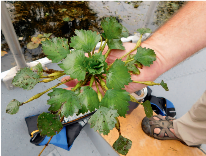
Figure 1. —Water chestnut observed in Silver Lake in Wayne County (Pennsylvania) by Barbara Lathrop, Water Program Specialist with the Pennsylvania Department of Environmental Protection (iMapInvasives Presence ID 1032016; https://imapinvasives.natureserve.org/imap/services/page/Presence/1032016.html ).

1). This easily recognizable species was selected because of the potential to eliminate small populations by manual removal (such as hand-pulling) when it is detected early. Although established in both states, the distribution is scattered and many waterbodies are not yet infested (Figure 2).