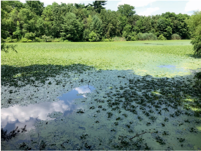
Figure 4. —Infestation of water chestnut in an unnamed waterbody near Arbor Glen in Montgomery County (Pennsylvania), observed by Jim Walter, Master Watershed Steward (iMapInvasives Presence ID 955132; https://imapinvasives.natureserve.org/imap/services/page/Presence/955132.html ).

delicatula ), which raises the need to survey for this particular tree species.