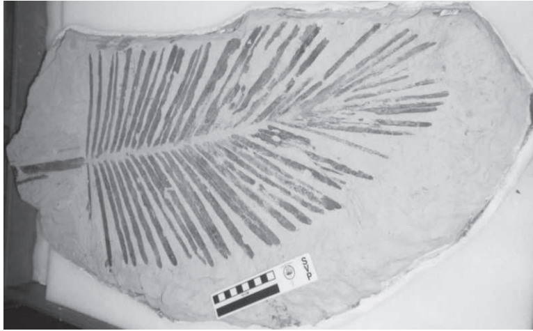
Fig. 2. A cycad leaf from Cabrillo National Monument (CABR) (SDMNH 48361).