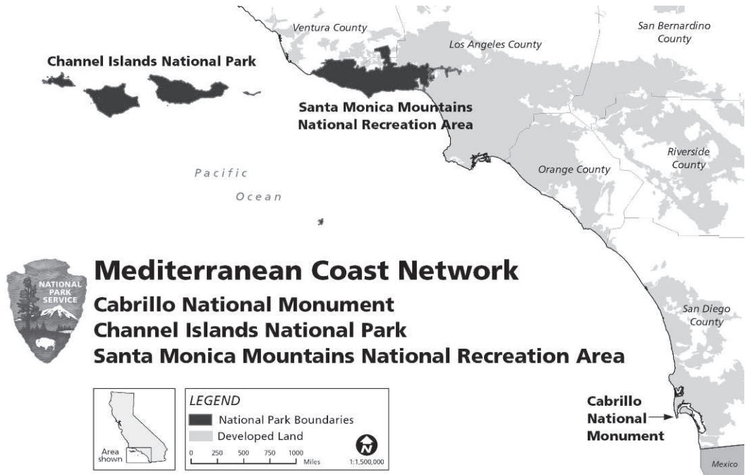
Fig. 1. Map of the Mediterranean Coast Network.

end, the 270 NPS units with significant natural resources have been divided into 32 networks based on their shared natural features and systems. Among these networks is the Mediterranean Coast Network (MEDN), which encompasses the southern third of the California coast (Fig. 1). Within the MEDN are 3 park units: Cabrillo National Monument (CABR), Channel Islands National Park (CHIS), and Santa Monica Mountains National Recreation Area (SAMO). Although none of these units were created with fossil resources in mind, each of them includes abundant fossils. In fact, CHIS and SAMO have some of the most extensive fossil records of any NPS unit.