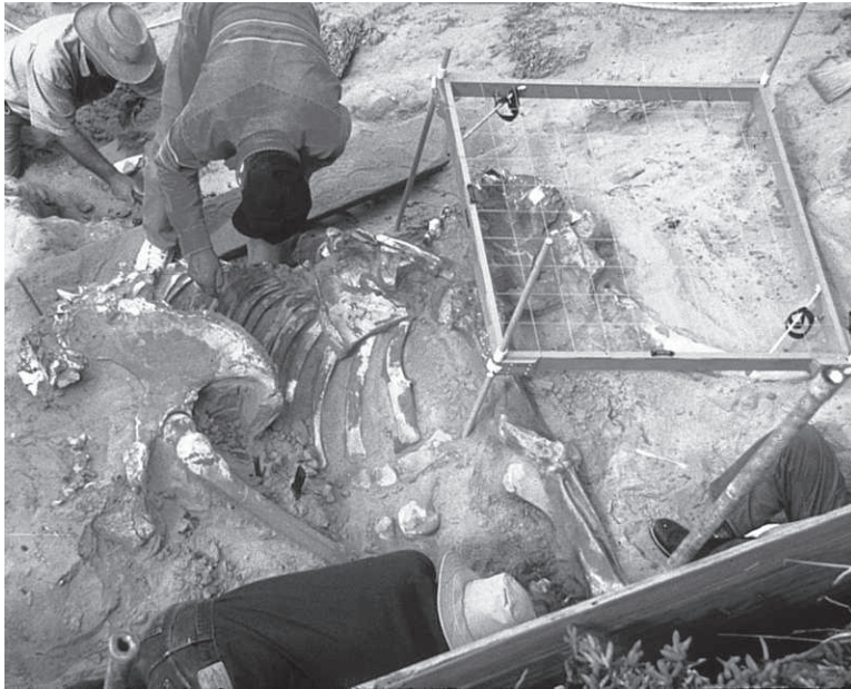
Fig. 4. The pygmy mammoth discovery of 1994 on Santa Rosa Island.