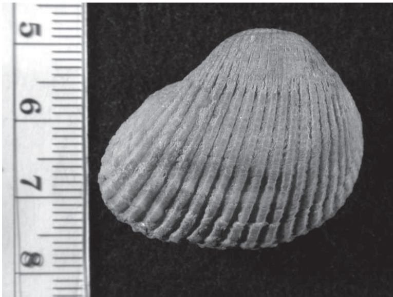
Fig. 7. Anadara (Anadara) topangaensis Reinhart 1943, right valve (holotype LACMIP 10095 [ex UCLA 3258]), from the Miocene Topanga Canyon Formation of Santa Monica Mountains National Recreation Area (SAMO).

older formations; but it does have several microfossil localities in the recreation area (Yerkes and Campbell 1979, Campbell and Yerkes 1980).