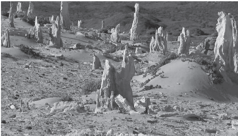
Fig. 5. A “fossil forest” on San Miguel Island.

2005). The discovery of a nearly complete pygmy mammoth skeleton in 1994 renewed interest in the fossils of the islands (Agenbroad and Morris 1999), and numerous publications concerning these animals have appeared, the most recent being Agenbroad (2012).