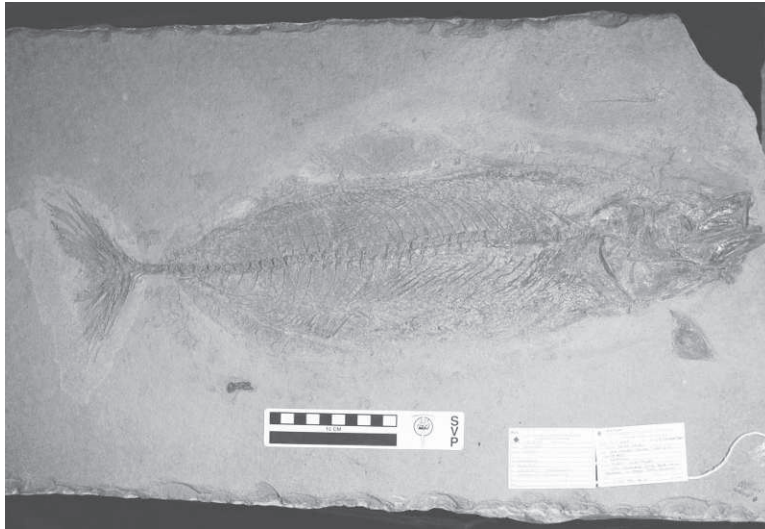
Fig. 8. Sardra stockii , a fish from the Modelo Formation of Santa Monica Mountains National Recreation Area (SAMO) (holotype LACM 1059).

from several localities in and around the eastern end of SAMO. A half-dozen species of fish were named from specimens probably recovered from land now within the recreation area's boundaries (David 1943). Another notable group of fossils from the recreation area and immediate vicinity is an assemblage of rare seaweeds (Parker and Dawson 1965). Egg cases of argonaut cephalopods have also been described (Saul and Stadum 2005). Other more typical fossils discovered in the formation within SAMO include several groups of marine microfossils, bivalves, gastropods, and echinoids and a few marine mammal bones (Hoots 1931). Good specimens of birds (Miller 1929, Howard 1958, 1962) and dolphins (Barnes 1985) have been found just outside of SAMO.