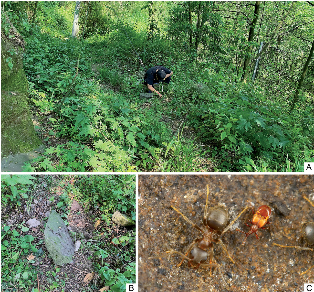
Fig. 3. Collection environment (A), habitat (B), and a living adult in situ (C) of Diartiger wangzheni sp. nov.