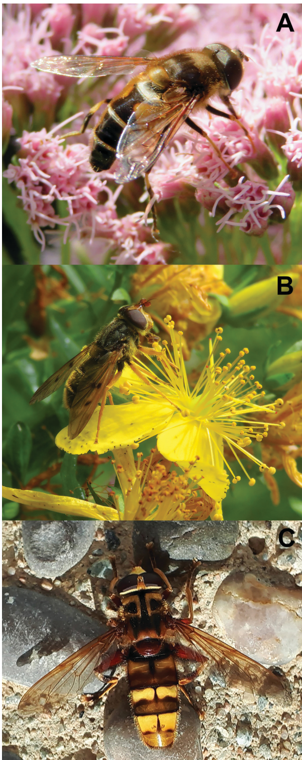
Fig. 2. Hoverfly species from Camprodon valley, Girona, Spain. (A) Eristalis pertinax , male, flowers of Eupatorium cannabinum , Setcases. (B) Ferdinandea cuprea , female, flowers of Hypericum sp., Vilallonga de Ter. (C) Milesia crabroniformis , male, Camprodon.