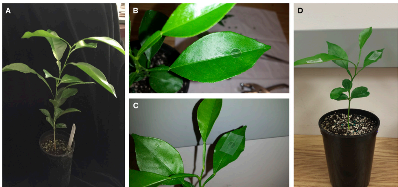
Fig. 1. Citrus leaf-disc grafting. (A) Two-month-old Valencia seedling used for the leaf-disc graft method for HLB transmission. (B) Leaf from a healthy seedling grafted with a CLas-infected leaf disc. (C) Grafted leaf disc kept in place with tape on both sides of the leaf. (D) Valencia seedling showing two leaf-disc grafts.

Real-time PCR —qPCR was performed as described by Li et al. (2006) for all 40 plantlets. The HLB-causing agent was confirmed in 32 of 40 plantlets or an 80% success rate. We considered plantlets positive if the cycle threshold was less than 28. The majority had a cycle threshold of between 18 and 22. The 12 control plantlets (not grafted with infected leaf discs) remained PCR negative.