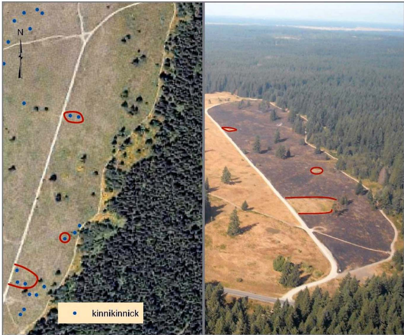
Figure 2. Aerial photo on the left shows locations of kinnikinnick ( Arctostaphylos uva-ursi ), an important larval host plant and nectar source for the hoary elfin butterfly ( Incisalia polia obscura ), within a proposed burn unit on Johnson Prairie, a high quality prairie site within the Puget Trough. This photo was used to help direct fire application at this site, as evidenced by the fire exclusions (marked in red) in the photo on the right.

provide mutually beneficial gains in knowledge and appreciation of the role of fire as a restoration tool. The successful application of prescribed fire at individual sites, however, depends on several socio-political and programmatic factors (Black et al. 2008).