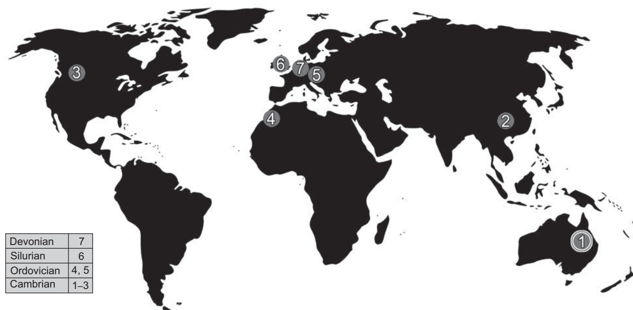
Fig. 4. Localities, in which Marrellomorpha (sensu Kühl et al. 2008) have been found. 1, Monastery Creek Phosphorite Formation, Late Templetonian–Early Floran, Australia: Austromarrella klausmuelleri gen. et sp. nov. 2, Kaili, early middle Cambrian, China: Marrella sp. (Zhao et al. 2003). 3, Burgess Shale, middle Cambrian, British Columbia, Canada: Marrella splendens Walcott, 1912 (Whittington 1971; García-Bellido and Collins 2006). 4, Fezouata biota, Ordovician, Morocco: Furca spp. (Van Roy 2006a, b; Van Roy et al. 2010). 5, Letná Formation, Ordovician, Czech Republic: Furca bohémica Fritsch, 1908 (Chlupáč 1999; Van Roy 2006a, b; Rak 2009; Rak et al. 2013). 6, Herefordshire, Silurian, England: Xylorhis chledophilina Siveter, Fortey, Sutton, Briggs and Siveter, 2007 (Siveter et al. 2007). 7, Hunsrück slate, Lower Devonian, Germany: Vachonisia rogeri Lehmann, 1955 (Kühl et al. 2008); Mimetaster hexagonalis Gürich, 1931 (Kühl and Rust 2010). Table indicates occurrences.

is known from the “Orsten”, and this is significantly smaller than the many species described from Burgess Shale-type lagerstätten.