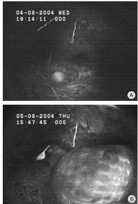
Figure 2. Still images captured from video showing (A) a House Mouse attempting to eat an unattended Atlantic Petrel egg, and (B) a Gough Moorhen inside the same burrow, a few hours later (note date and time data on top left hand corner of images) eating the egg.

Mice pose a significant threat to Gough Island's biodiversity (Jones et al. 2003, Wanless et al. 2007). Plans to eradicate the mice, using poisons proven to be effective against mice but which are also toxic to birds, are well advanced (Brown