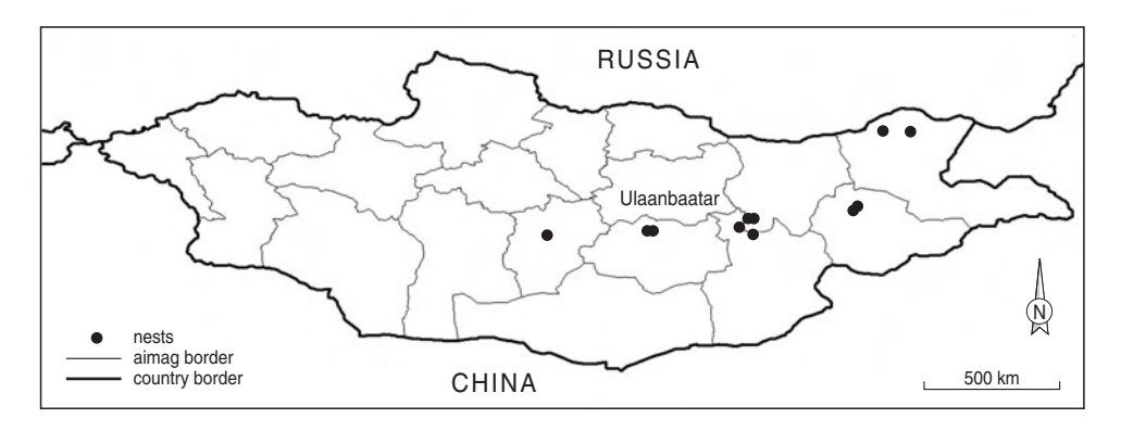
Figure 1. Locations of 11 Eagle Owl nests studied in Mongolia, 2004–06.

Adiya (2000), Bannikov (1954), Dulamtseren (1987), Enkhbold (unpubl. data) and Sokolov & Orlov (1980). Unidentified prey remains were excluded from biomass estimates. We used descriptive analyses (for height of substrates, sizes of clutch and pellet, weight of prey species) and correlation analyses (on height of substrate and number of eggs and chicks; frequency and weight of prey species of birds and mammals) for statistical analysis as developed by Krebs (1989) and Jump 5.0 Statistical Discovery from SAS Software, USA and Microsoft Excel. Means ± SD are given.