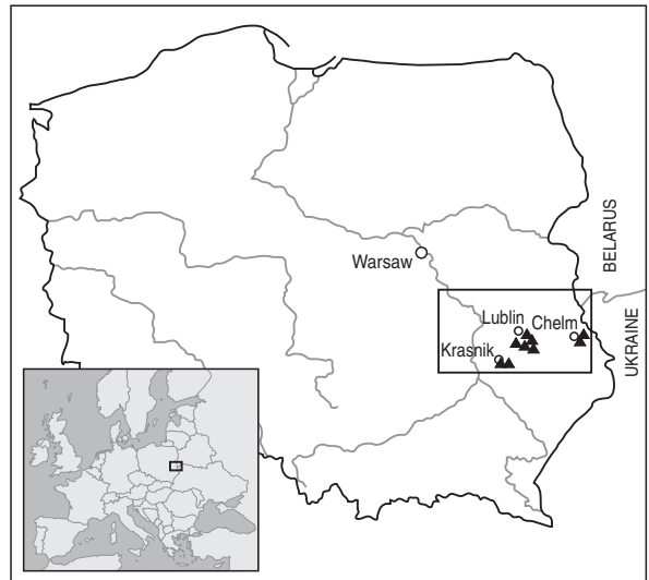
Figure 1. Location of Little Owl study sites in the Lublin Region, eastern Poland.

Locations of radio-marked owls were made between 27 April and 3 August, i.e. from egg laying until the young dispersed, during 2000 to 2003. Observers tracked owls on foot, and observation periods on each owl typically started before nightfall at 19:00–20:00 and lasted until 4:00–5:00. Owl locations were plotted on 1:10 000 scale maps using the triangulation