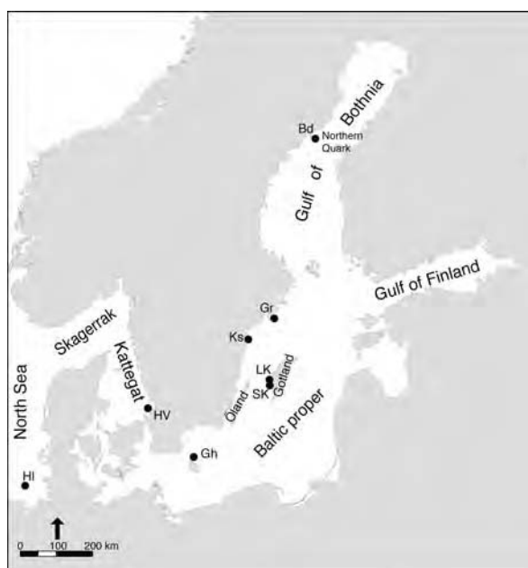
Figure 1. Map of the Baltic Sea and adjacent sea areas, with geographical names mentioned in the text. Bd Bonden, Gh Gräsholmen, Gr Grän, Hl Helgoland, Hv Hallands Väderö, LK Lilla Karlsö, SK Stora Karlsö and Ks Källskären.

duals were landed at five occasions; 11 November 1987 (13 specimens), 28 October 1988 (4), 2 November 1988 (10), 29 November 1988 (50) and 14 November 1989 (72), respectively.