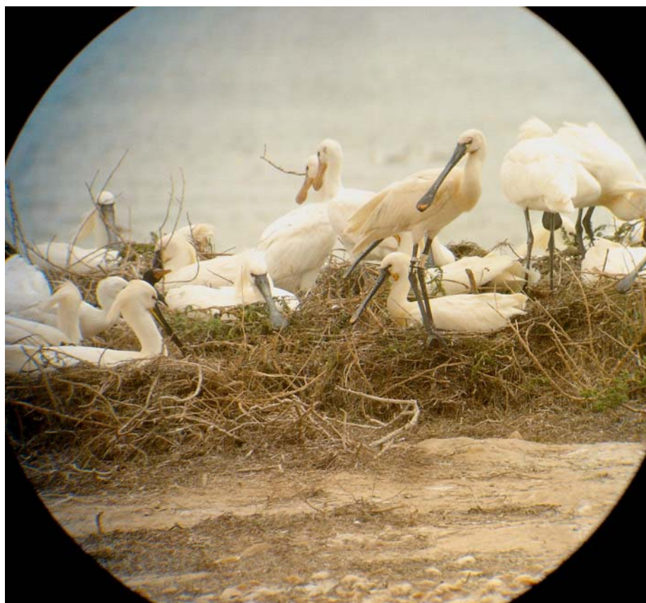
Figure 3. A colour-ringed bird born on Terschelling in 1997 standing on its nest on Nair (Banc d'Arguin) on 17 May 2010. A month later it was observed feeding chicks. Its partner (sitting on the nest) has a yellow bill tip. Given that male spoonbills generally have larger bills than females, the standing bird is probably a male.

studies on avian subspecies. A sample of studies on migrant bird species, although generally using slightly smaller sets of microsatellite loci, showed rather comparable levels of differentiation; in order of increasing F_{ST} : Dunlin Calidris alpina (three subspecies, 7 loci, F_{ST} \leq 0.010 ; Marthinsen et al. 2007), Canada Goose Branta canadensis (two subspecies, 6 loci, F_{ST} = 0.021 ; Mylecraine et al. 2008), Bluethroat Luscinia svecica (seven subspecies, 7–11 loci, F_{ST} = 0.042 ; Johnsen et al. 2006), Reed Bunting Emberiza schoeniclus (two subspecies, 6 loci, F_{ST} = 0.043 ; Kvist et al. 2011), and Piping Plover Charadrius melodus (two subspecies, 8 loci, F_{ST} = 0.104 ; Miller et al. 2010). Thus, with F_{ST} = 0.063 , the observed genetic differentiation between the two Spoonbill subspecies seems to fall in the upper range of values. On the basis of this comparison the subspecies status of balsaci seems entirely valid.