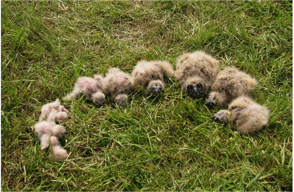
One of the Short-eared Owl broods in grassland in Hommerts (Province of Fryslân) on 7 July 2014, with nine chicks about to be ringed. Many of the broods were found in regular grassland, not in nature reserves.

populations (Calladine et al. 2012), several questions arise. Irrupective species are known to be great nomads, in the case of the Short-eared Owl moving as far as 4000 km during natal dispersal (Newton 2006). Such irruptions occur after a prolific breeding season that is followed by a crash in vole numbers. A classic example is a winter brood in the newly reclaimed polder Oostelijk Flevoland, from which a young ringed on 11 December 1959 was recovered near Archangelsk, 2400 km away, on 12 May 1960 (Cavé 1961). But why would a nomadic Short-eared Owl turn up in Western Europe, for years the scene of impoverished vole densities? What are the chances to detect a rare event like the 2014 vole peak anyway? And what costs does it entail to exploit vast areas with poor food supply? In the past, recently reclaimed polders (Cavé 1961) and young forestry plantations (Village 1987) attracted tens, sometimes hundreds, of pairs when vole peaks were more regular and certainly involved higher densities over a longer time period. But those days are no more. Clearly, even though food conditions have consis-