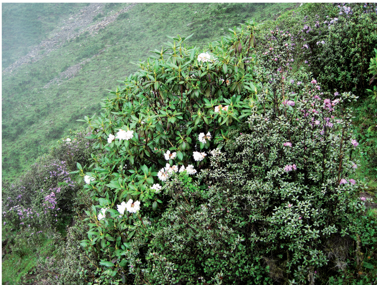
Fig. 7. Photograph of type locality of Leistus ( E. ) rezabkovae sp. n.