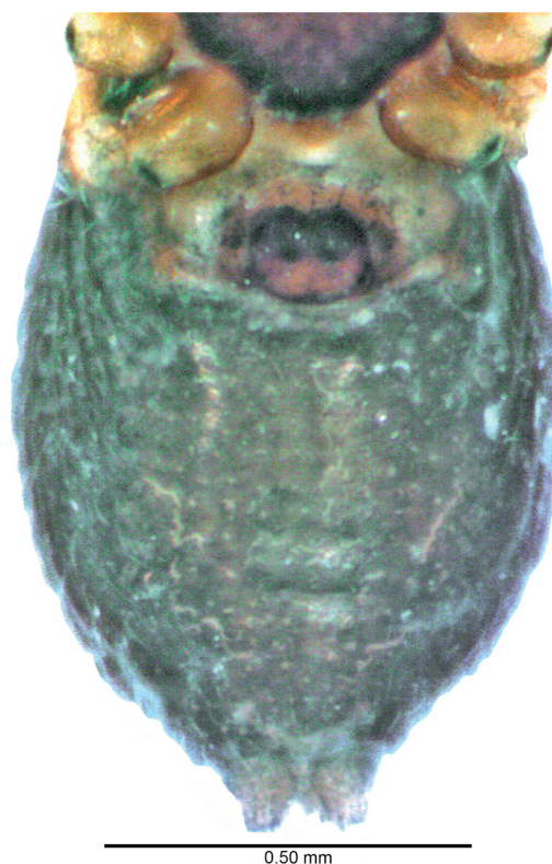
Fig. 1. Micrargus fuscipalpis (Denis, 1962) comb. nov., female holotype. Abdomen, ventral view.

Remarks: Enguterothrix fuscipalpis was described on the basis of two females from Uganda (Denis, 1962) and was incorrectly placed in this genus. The holotype (the paratype was not seen) does not belong to Enguterothrix , which is supported by a different formula of chaetotaxy and by a dissimilar epigyne conformation. Moreover, I could not find any other Enguterothrix specimens among the Afrotropical linyphiids that I have seen so far, therefore I preliminarily place this species in Micrargus . The transfer is supported by the same chaetotaxy (2.2.1.1), lack of the trichobothrium on metatarsus IV, similar value of the TmI (0.35), as well as the similar epigyne conformation, namely, the presence of a large epigynal cavity (see Fig. 1). The discovery of the corresponding male will throw more light on the systematic position of this species within the linyphiids.