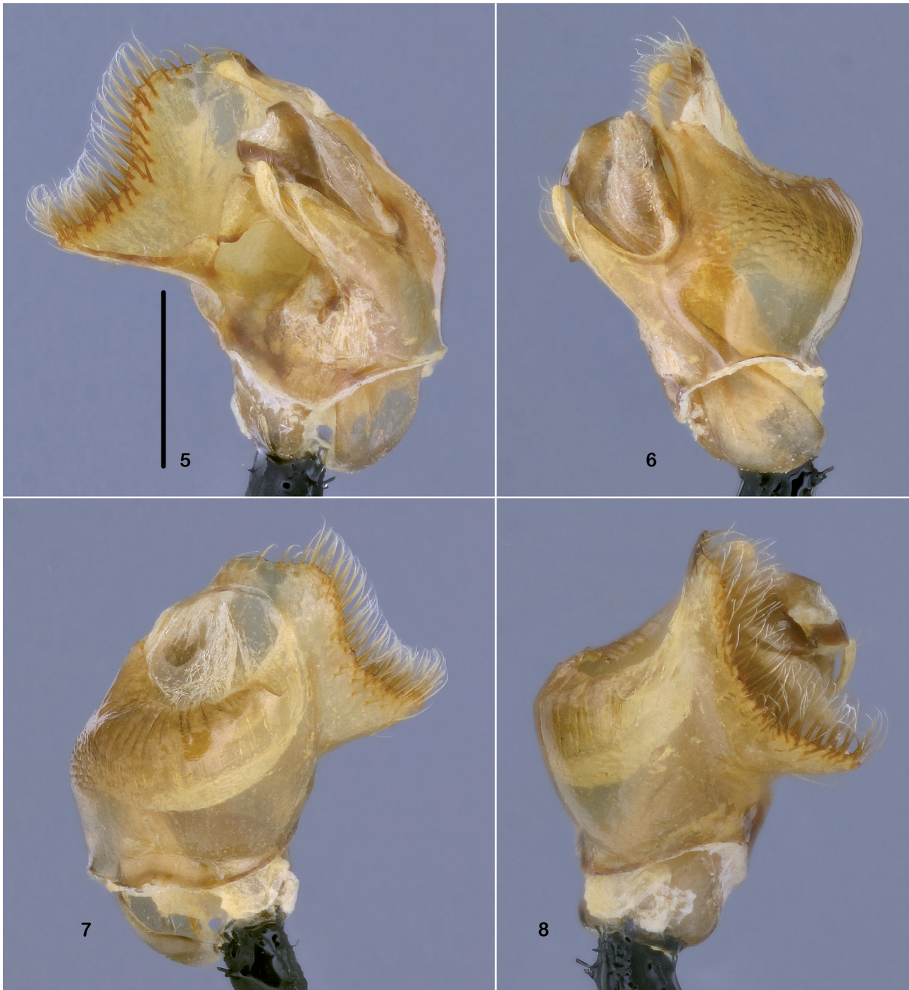
Figs 5-8. Aedeagus of Paramaronius unituberculatus sp. nov. (holotype, NMB). (5) Dorsal view. (6) Left view. (7) Ventral view. (8) Right view. Scale = 0.5 mm.

margin almost straight and with a small notch at middle; coxites (Fig. 12) small and membranous, base long and slender; styles short, wider apically.