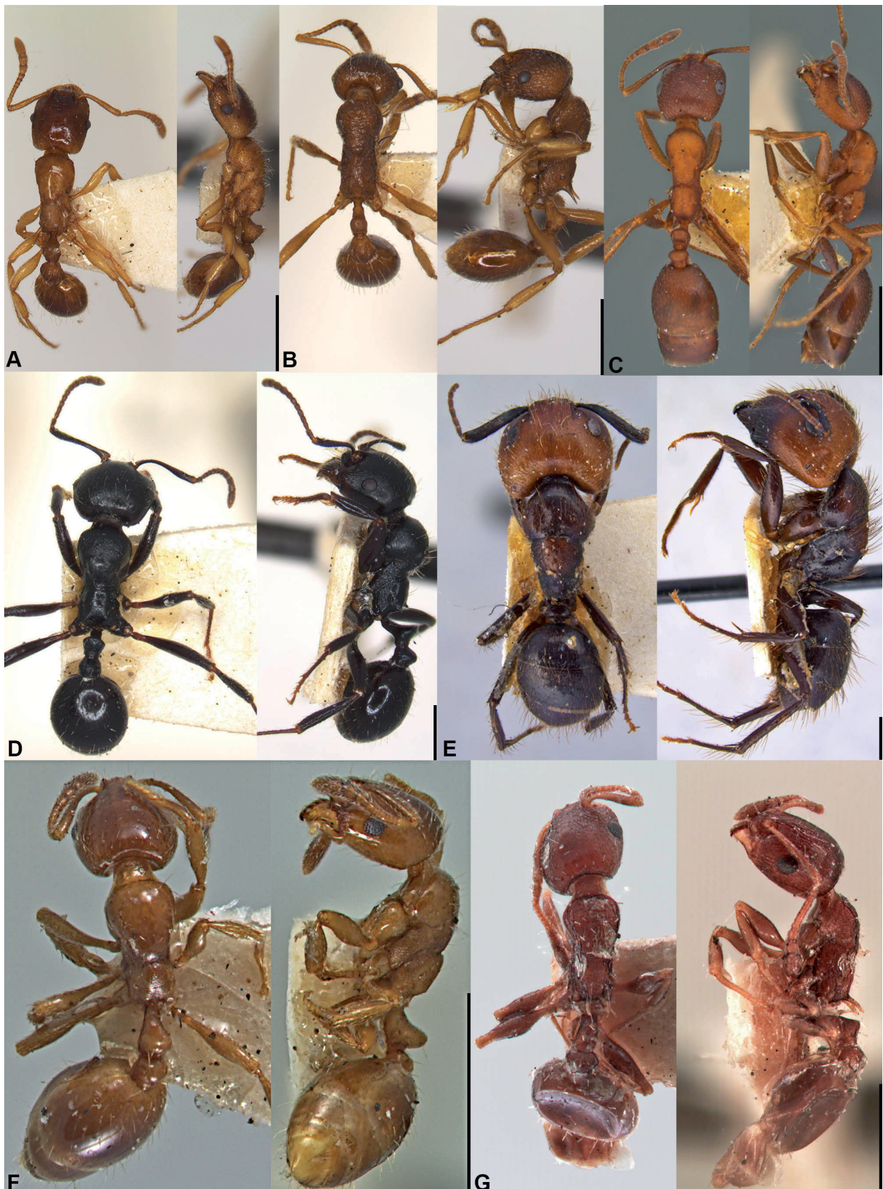
Fig. 1. Syntypes ♀ dorsal/lateral views. (A) Strongylognathus huberi Forel, 1874. (B) Myrmica smythiesii Forel, 1902. (C) Monomorium indicum Forel, 1902. (D) Messor lobicornis Forel, 1894. (E) Camponotus bugnioni Forel, 1899. (F) Monomorium smithii Forel, 1892. (G) Temnothorax algiricus trabuttii (Forel, 1894). Scale bars 1 mm.