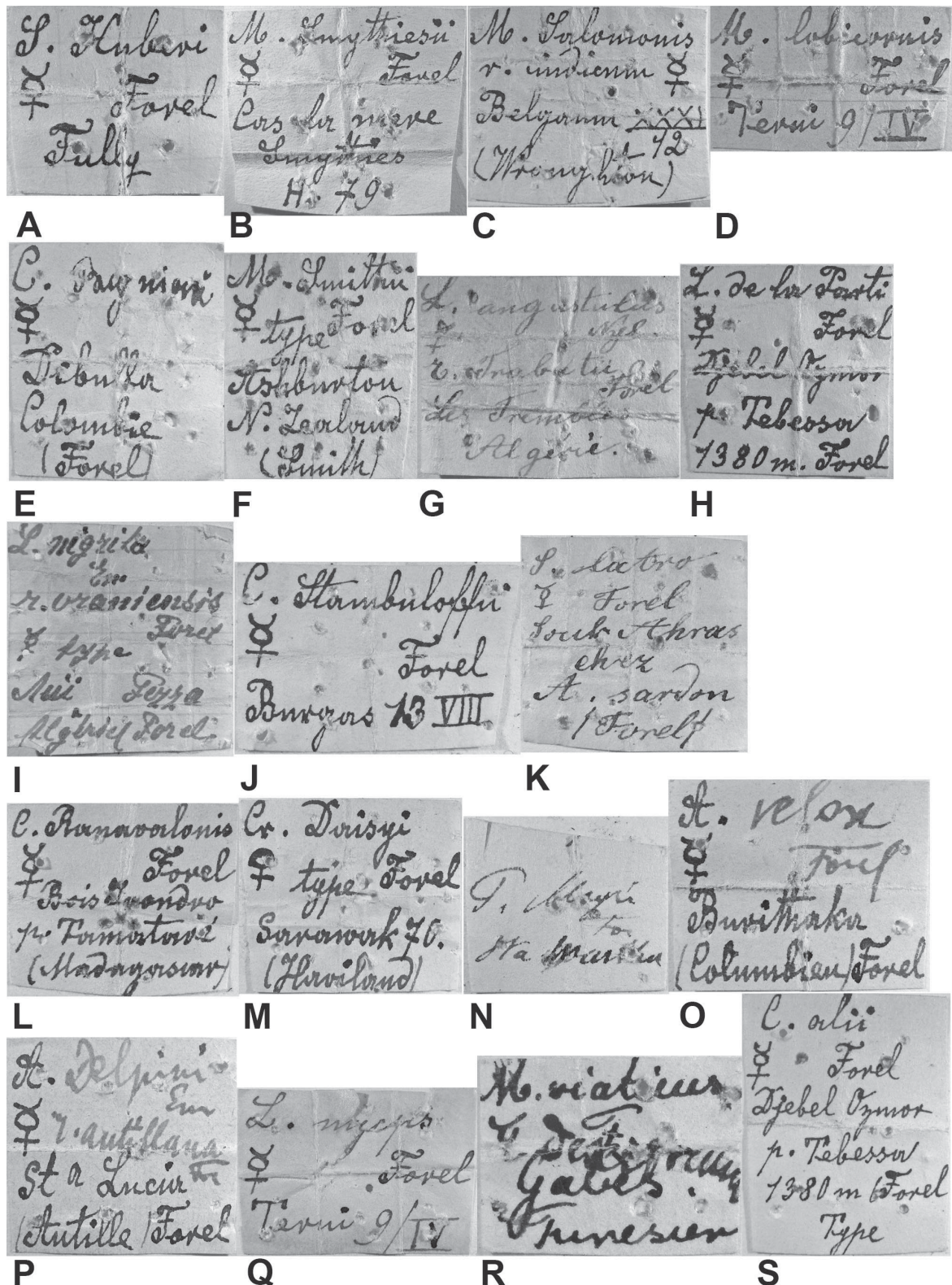
Fig. 4. Original labels of 16 syntypes and 2 paralectotypes. (A) Strongylognathus huberi Forel, 1874. (B) Myrmica smythiesii Forel, 1902. (C) Monomorium indicum Forel, 1902. (D) Messor lobicornis Forel, 1894. (E) Camponotus bugnioni Forel, 1899. (F) Monomorium smithii Forel, 1892. (G) Temnothorax algiricus trabutii (Forel, 1894). (H) Temnothorax delaparti (Forel, 1890). (I) T. oraniensis (Forel, 1894). (J) Cardiocondyla stambuloffii Forel, 1892. (K) Solenopsis latro Forel, 1894. (L) Crematogaster ranavalonae Forel, 1887. (M) C. daisyi Forel, 1901. (N) Pogonomyrmex mayri Forel, 1899. (O) Azteca velox Forel, 1899. (P) A. delpini antillana Forel, 1899. (Q) Lasius myops Forel, 1894. (R) Cataglyphis savignyi (Dufour, 1862). (S) Camponotus alii Forel, 1890.