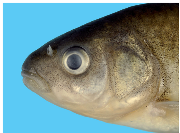
Fig. 2. Carassius praecipuus CMK 22746, paratype, 62.0 mm SL; head (reversed). ▶

straight line to dorsal-fin base, then more or less straight to caudal-fin base. Caudal peduncle 1.3-1.4 times longer than deep. Interorbital area convex. Head longer than deep, dorsal profile straight; ventral profile arched from mouth to pelvic-fin base, then straight to anal-fin origin; snout blunt. Mouth terminal to subterminal, anteriormost point of cleft below level of lower margin of eye, upper lip slightly projecting beyond tip of lower jaw. Lower jaw-quadrate junction about at vertical of anterior margin of eye. 10+10 (1), 10+11 (4*) or 11+10 (1) = 20-21 gill rakers on first gill arch, their length about 1-1.5 times width of arch and about 3-4 times in length of gill filaments at same position.