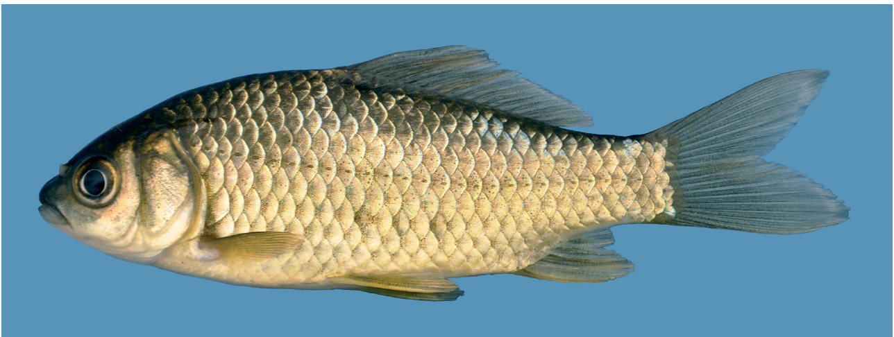
Fig. 5. Carassius auratus , CMK 25714, 68.4 mm SL; Laos: Houaphan Province: Nam Ma drainage.

The material of the new species was obtained during a survey conducted in connection with an Environmental Impact Assessment of the Nam Ngum 3 hydropower project. It is a pleasure to thank François Obein for