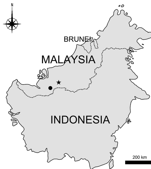
Fig. 1 Research sites of previous studies and this study. Star: Nanga Tekalit (the type locality of both M. phaeomerus and M. poecilus ), Closed circle: Lanjak Entimau (our study site).

Sampling took place at Sungei (=river) Jelak, a branch of Sungei Engkari, Bukit Lanjak, Division Sri Aman, Sarawak, Malaysia (1°20'N, 112°00'E), alt. 250 m (Fig. 1), on 24 August 1993. After collecting frogs, we took muscle tissues for later biochemical analysis and preserved the frogs as vouchers. Adult specimens were anesthetized with acetone chloroform (chloretone), fixed in 10% formalin, and later preserved in 70% ethanol. Larvae were directly fixed and preserved in 5% formalin solution except for two samples for DNA analyses, which were crudely homogenized with 99% ethanol using a pair of scissors. The assignment of larvae to species was based on matching of mtDNA sequences to that of adult forms. Specimens examined are stored at the Graduate School of Human and Environmental Studies, Kyoto