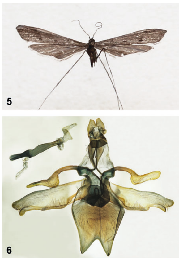
Figs 5, 6. Agdistis buffelsi sp. n., holotype: (5) adult; (6) male genitalia, BMNH 22732.

Distribution: South Africa (Northern Cape, Western Cape).