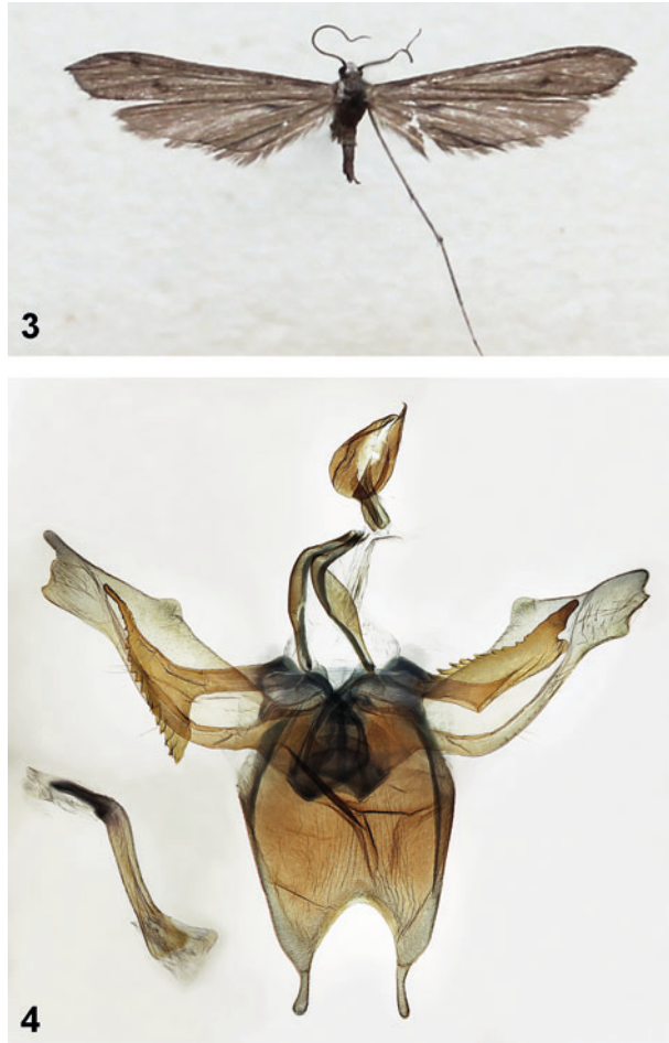
Figs 3, 4. Agdistis vansoni sp. n., holotype: (3) adult; (4) male genitalia, BMNH 22728.

Male genitalia (Fig. 4): Valvae asymmetrical with angular projections along costal margin. Left valva slightly narrowed distally and acute apically. Costal projection on left valva ends with strong brush-like plate with serrate outer margin. Right valva slightly narrowed distally and forms small incisions on cucullar side. Costal projection on right valva has strong serrated plate on upper edge, projection's tip markedly narrowed. Uncus beak-shaped, strongly developed and bifurcated. Sternite VIII with oval-shaped incision. Lobes of sternite VIII rather long, noticeably narrowed distally. Aedeagus slightly longer than costal projection on right valva, apically slightly bent and tapering.