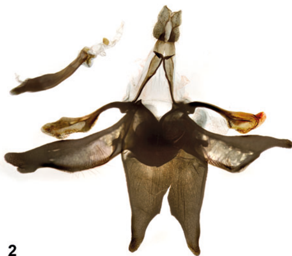
Figs 1, 2. Agdistis iversoni sp. n., holotype: (1) adult; (2) male genitalia, TMSA 15264.

Distribution: South Africa (Northern Cape).